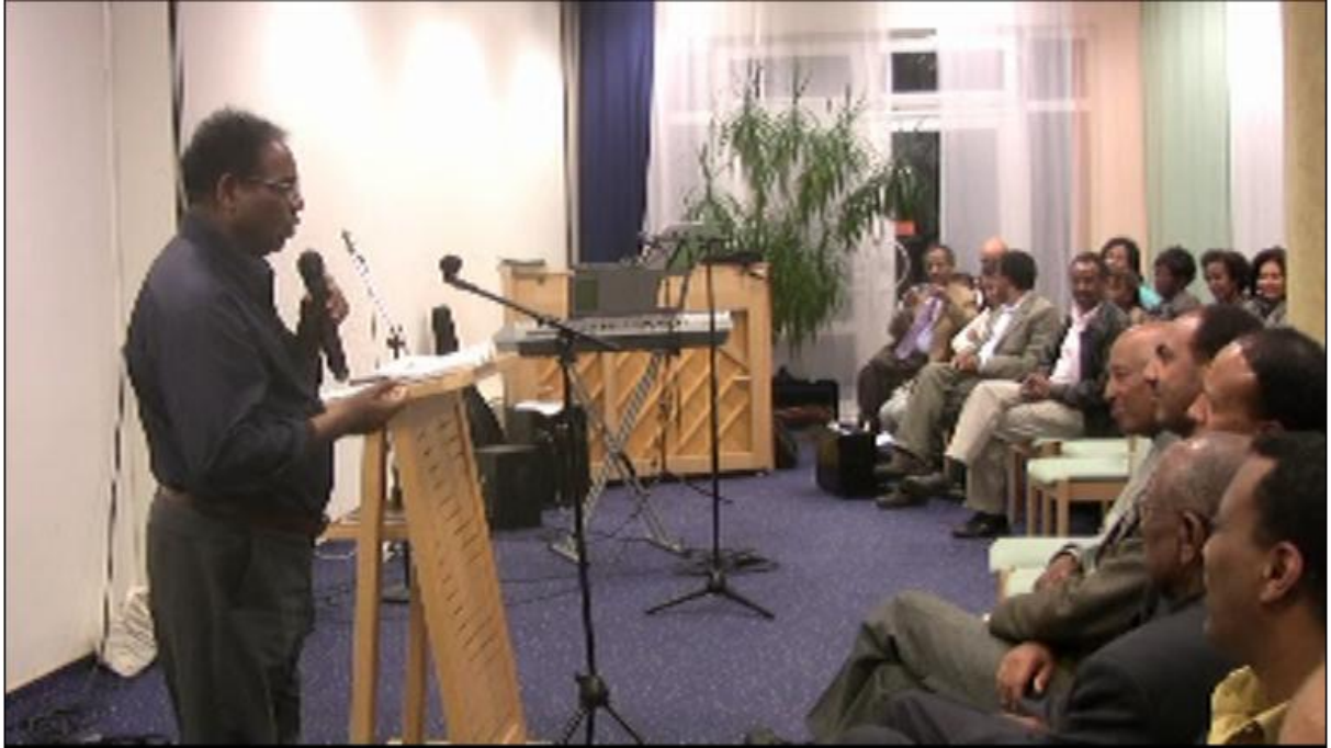
Berekt on the podium