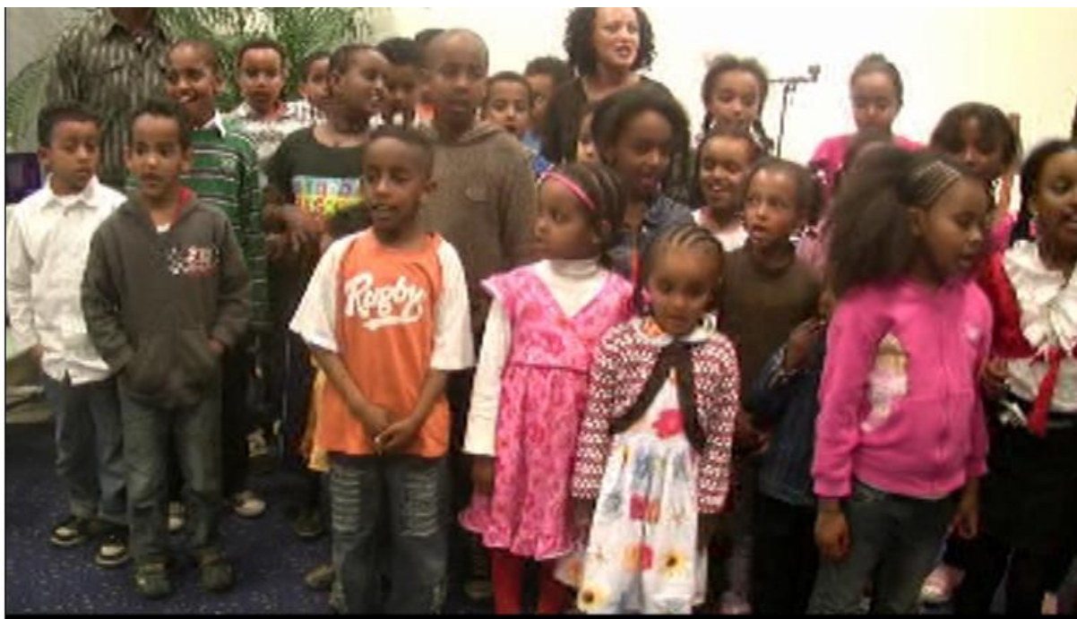
The children group singing