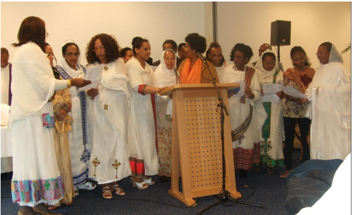
Singers in Tigre language (Geleb)