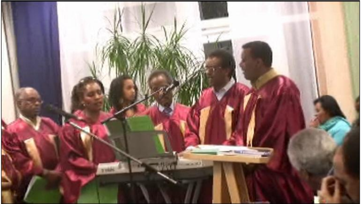
The quire from Germany