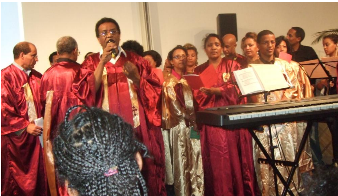
The quire from Germany