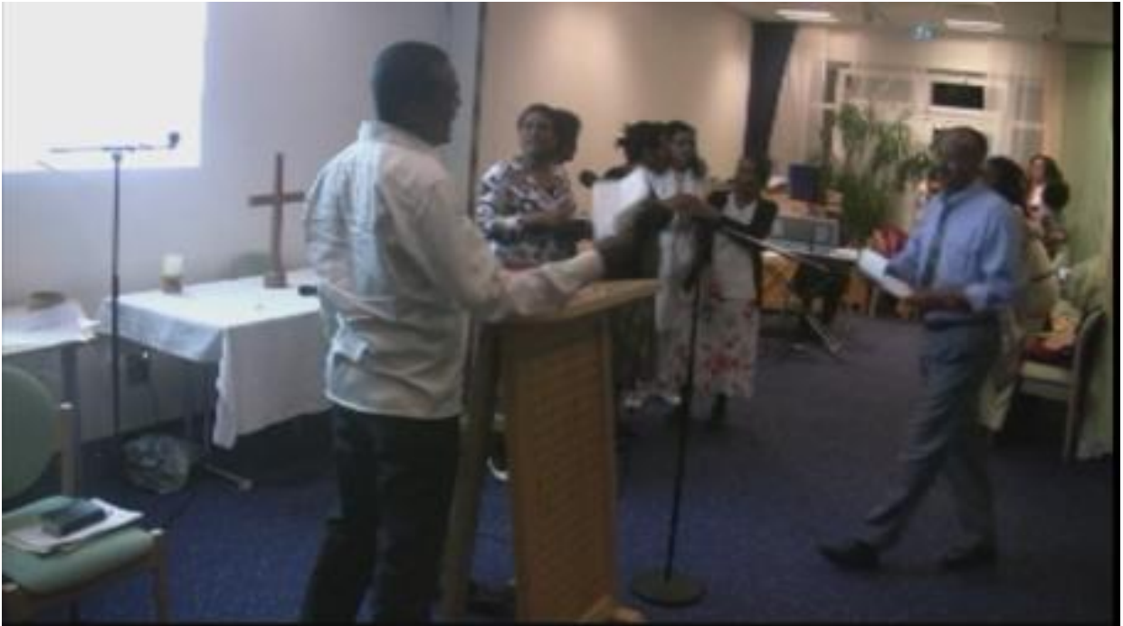
The group from Norway