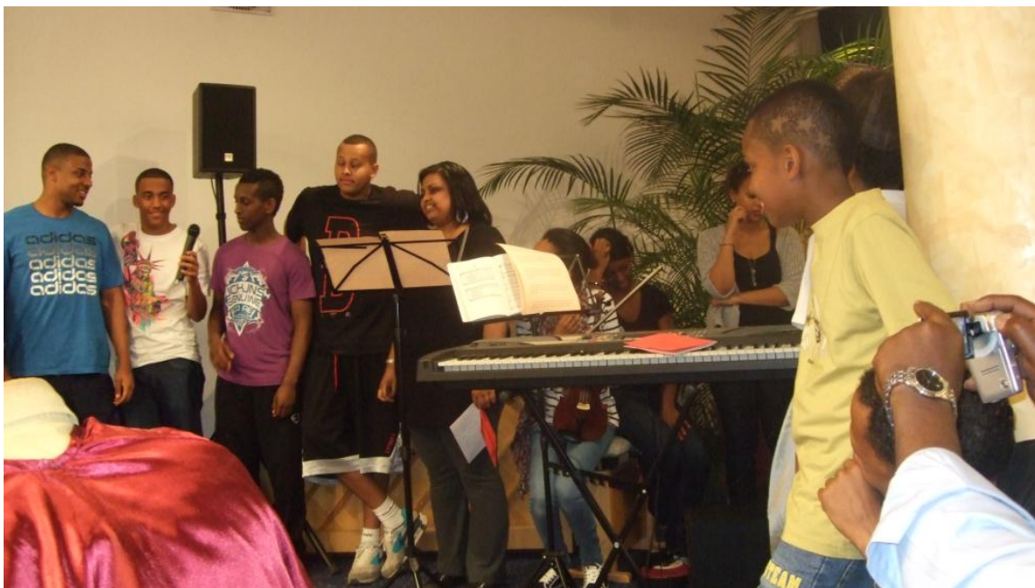
Children singers from the Germany group