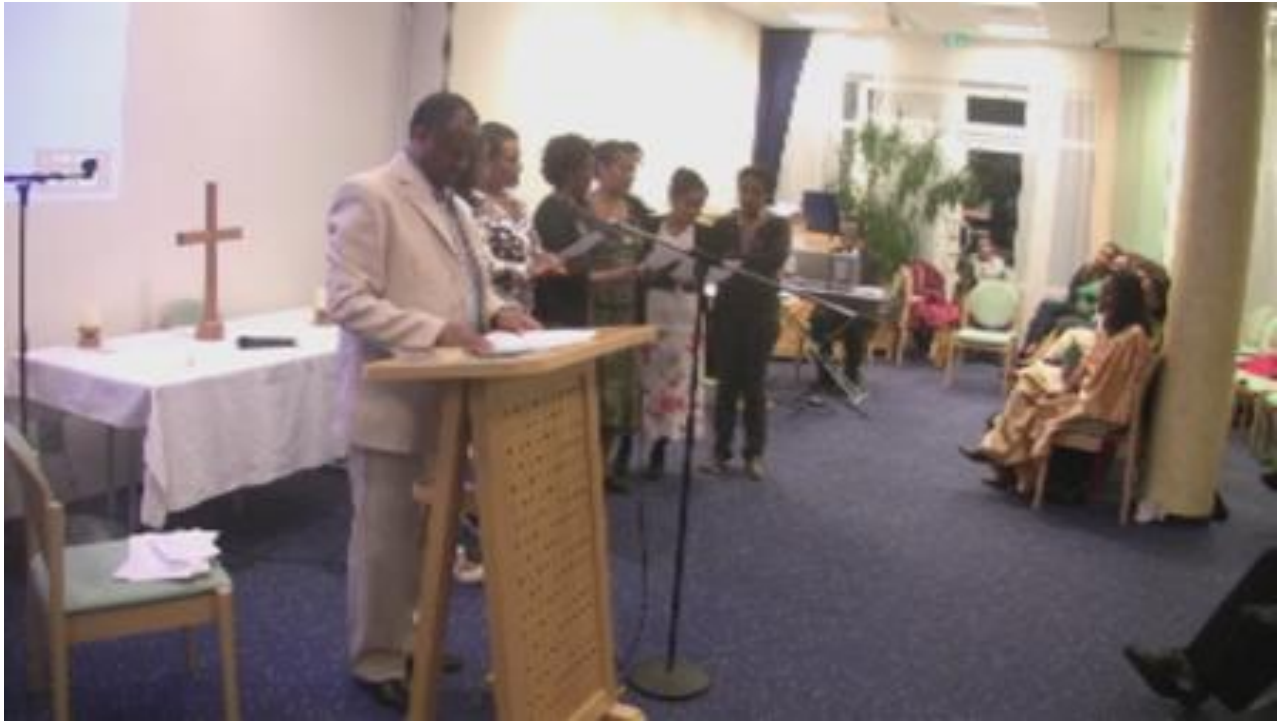
The group from Norway singing