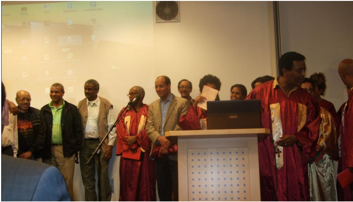
The group from Germany