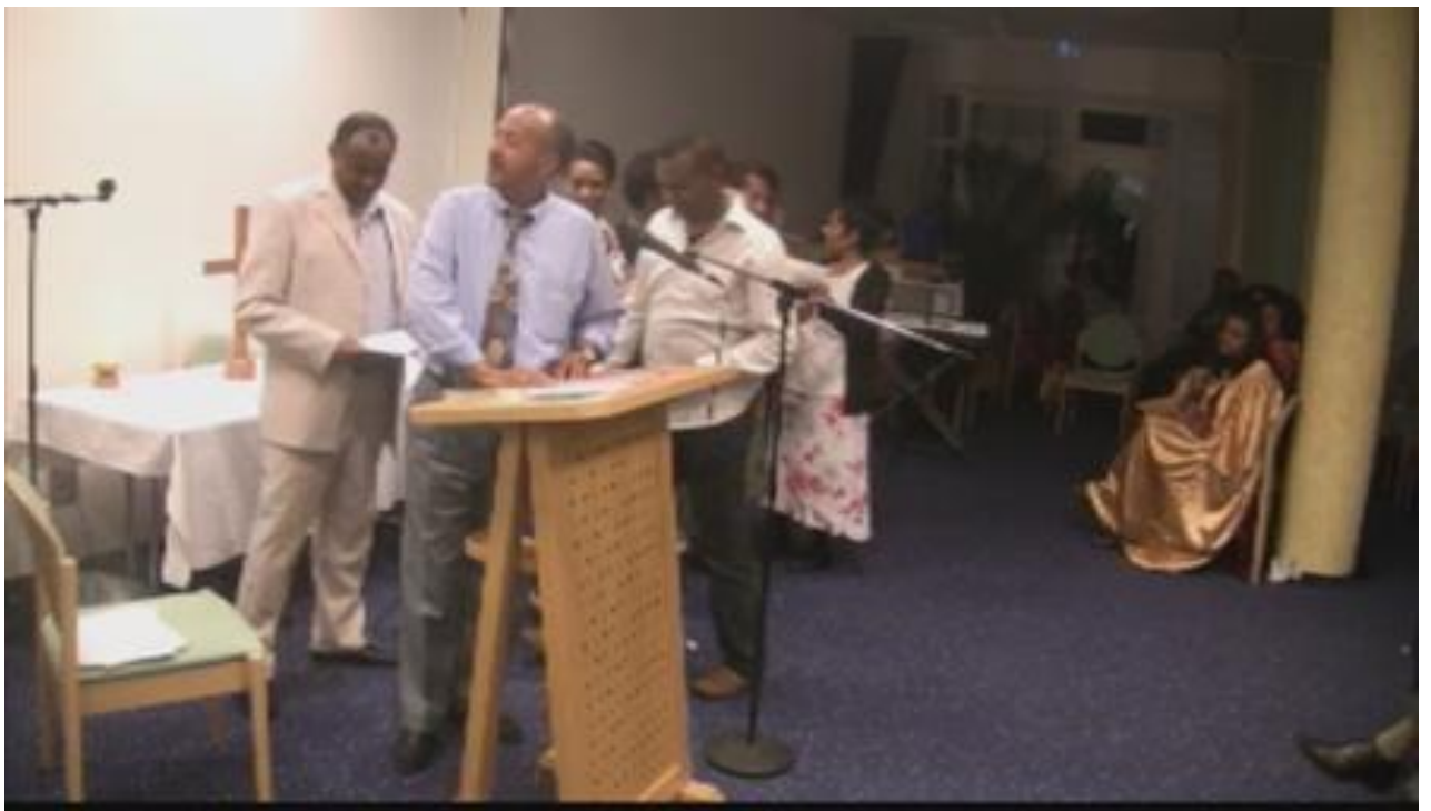
The Norway group presenting an old gospel song