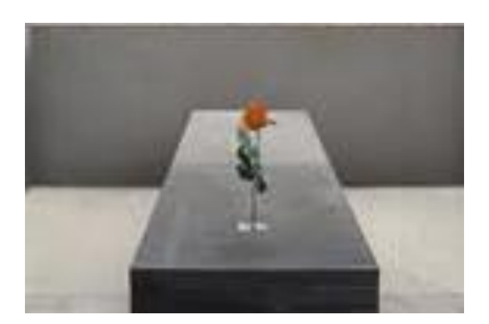
----- The End -----

During his stay in Saudi-Arabia, despite his bad health, he worked tirelessly trying to bring about a compromise agreement between the EPLF and ELF. Although he was successful to hold several social meetings between the leaders of the two organizations, his attempts to reconcile the two antagonizing leaders never bore any fruit. Apprehensive of the failure of senior Eritrean leaders and notables to bring about the reconciliation of the different organizations, mainly the EPLF, the ELF-PLF and the ELF, he died in the eighties before realizing his dream and was buried in Jeddah.