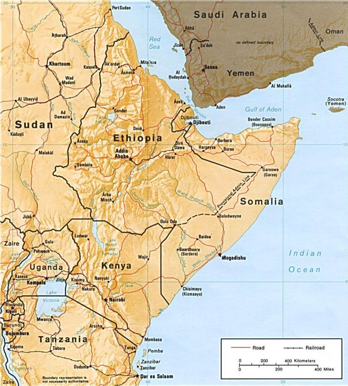
Possibly safe routes. Invisible lines on map