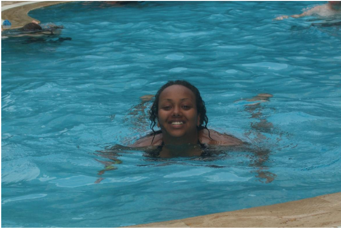
Helena in Antalya, Turkey 2011