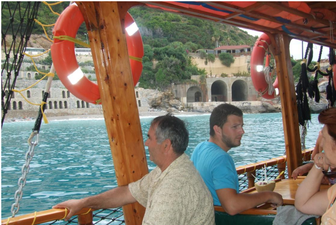
Boat tour around Antalya