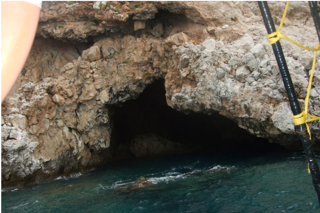
A place where pirates used to hide