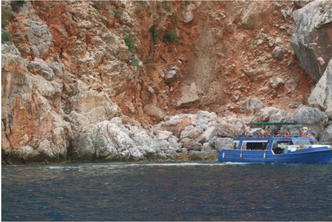
Close encounter of the rocky shores of Antalya