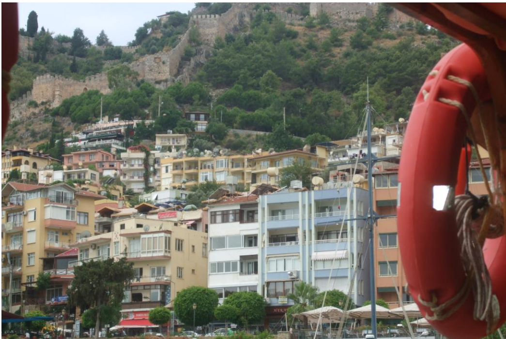
A snapshot from Margareta hotel