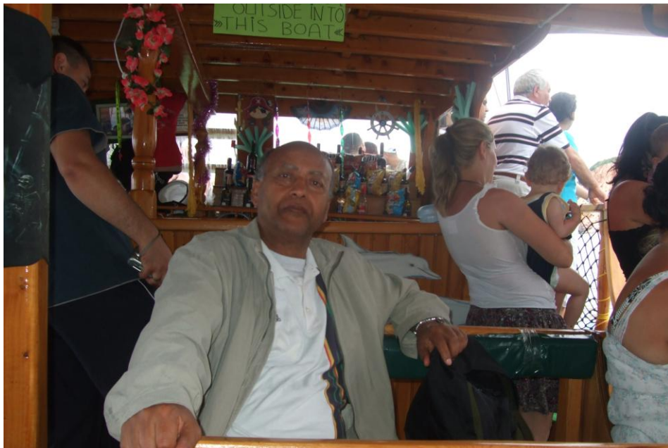
Yet another snapshot in the boat