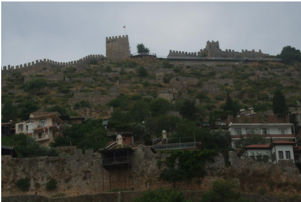
Fortified mountain tops