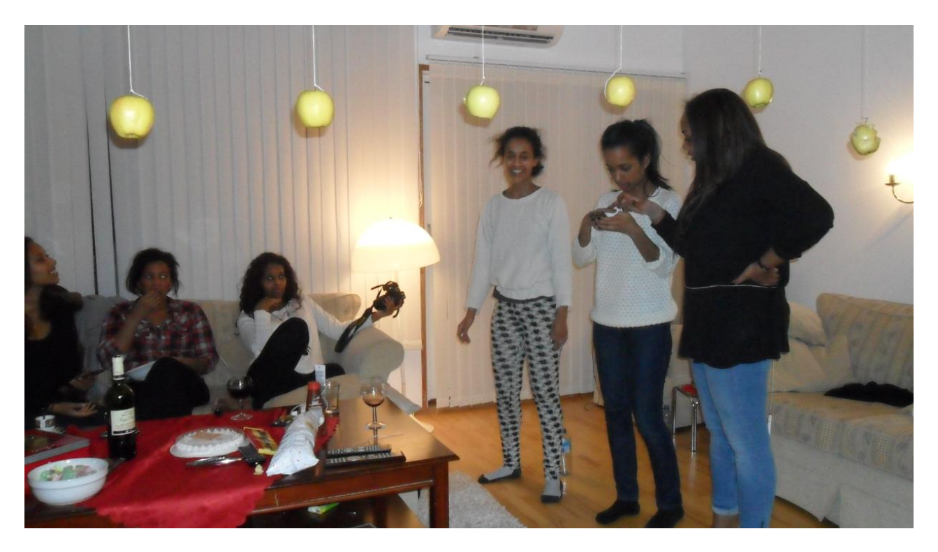
The cousins preparing for the competition