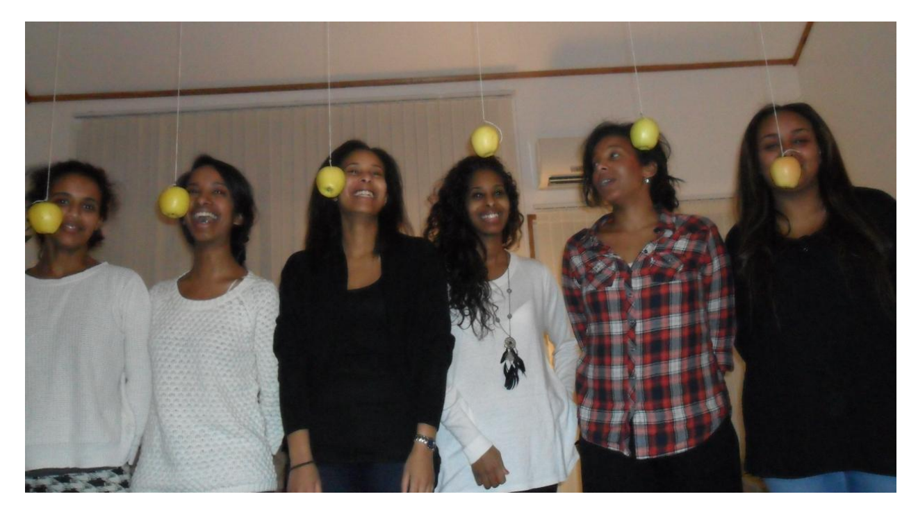
All the cousins competing in eating hanging apples without using their hands