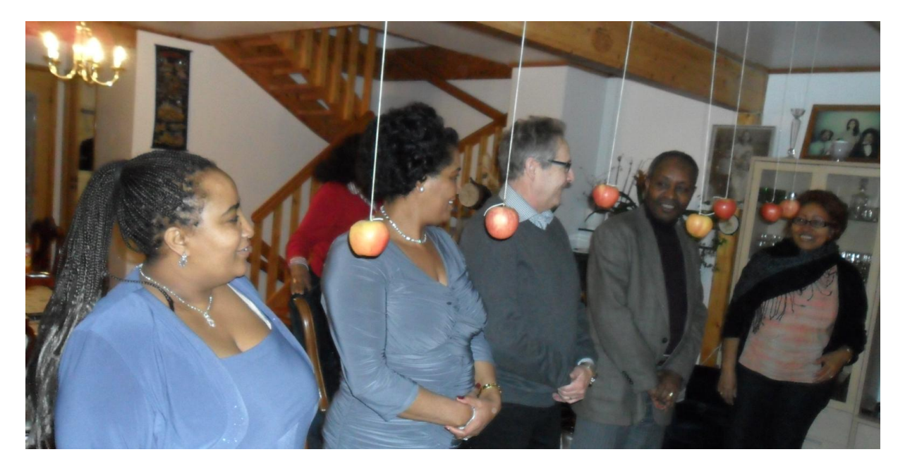
A competion between Sunde, Tasta and Gandal