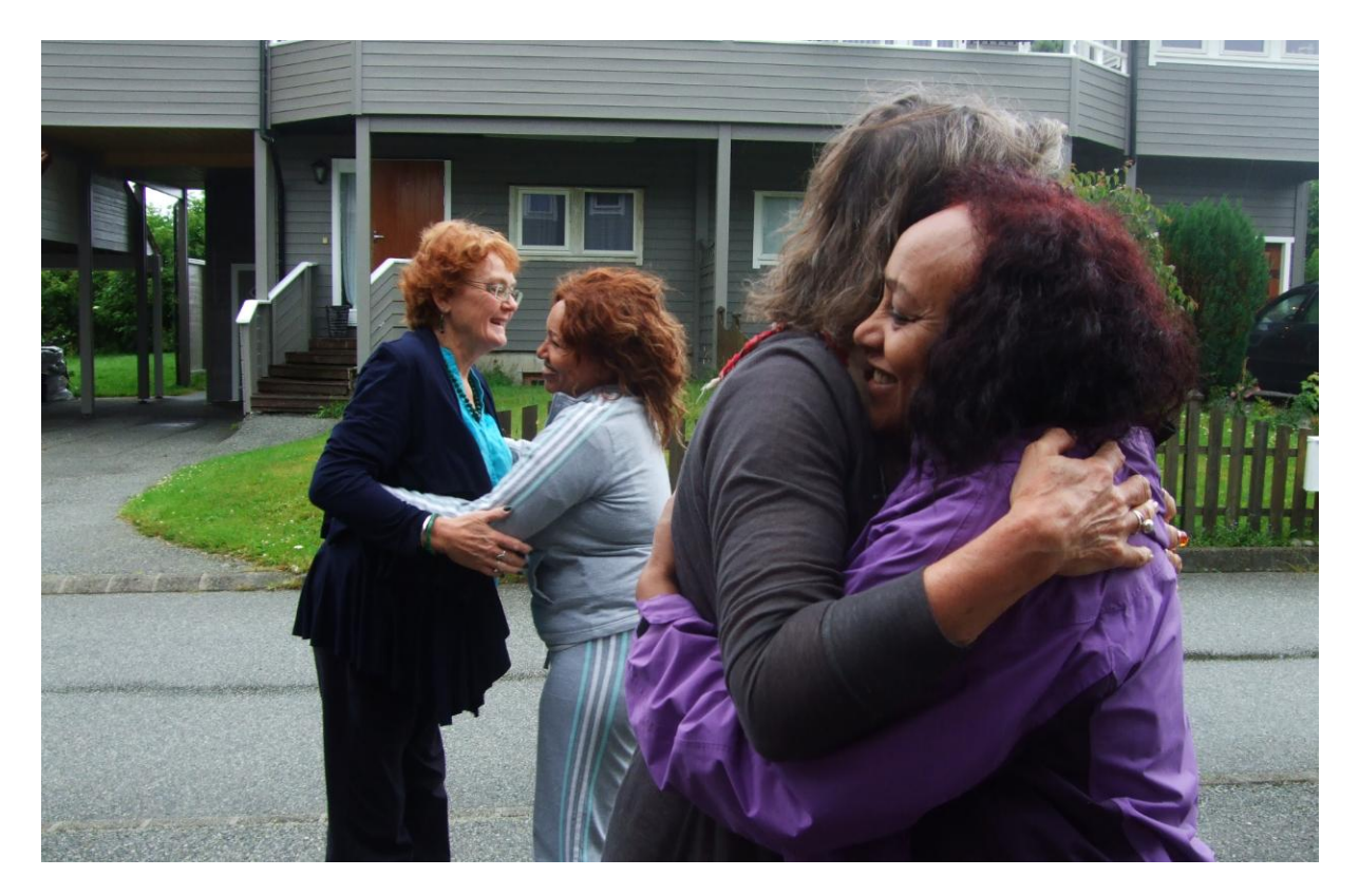
Bidding farewell to our dear guests from Nottingham