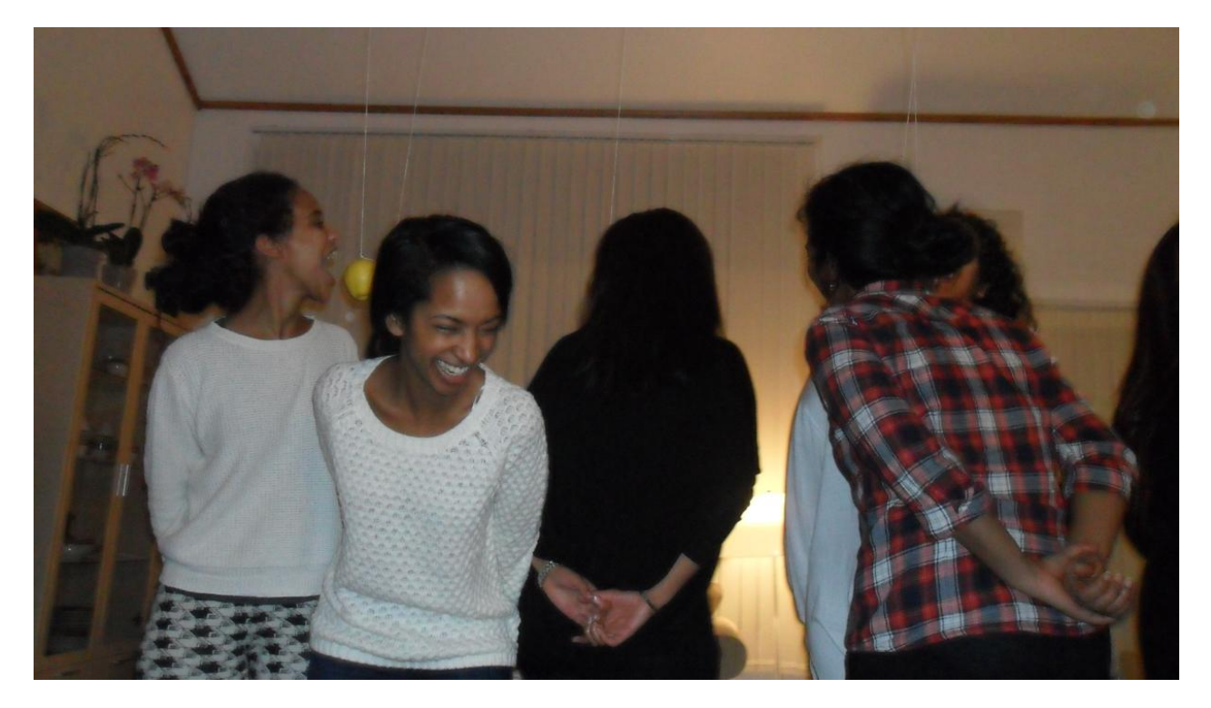
The competition created a lot of fun