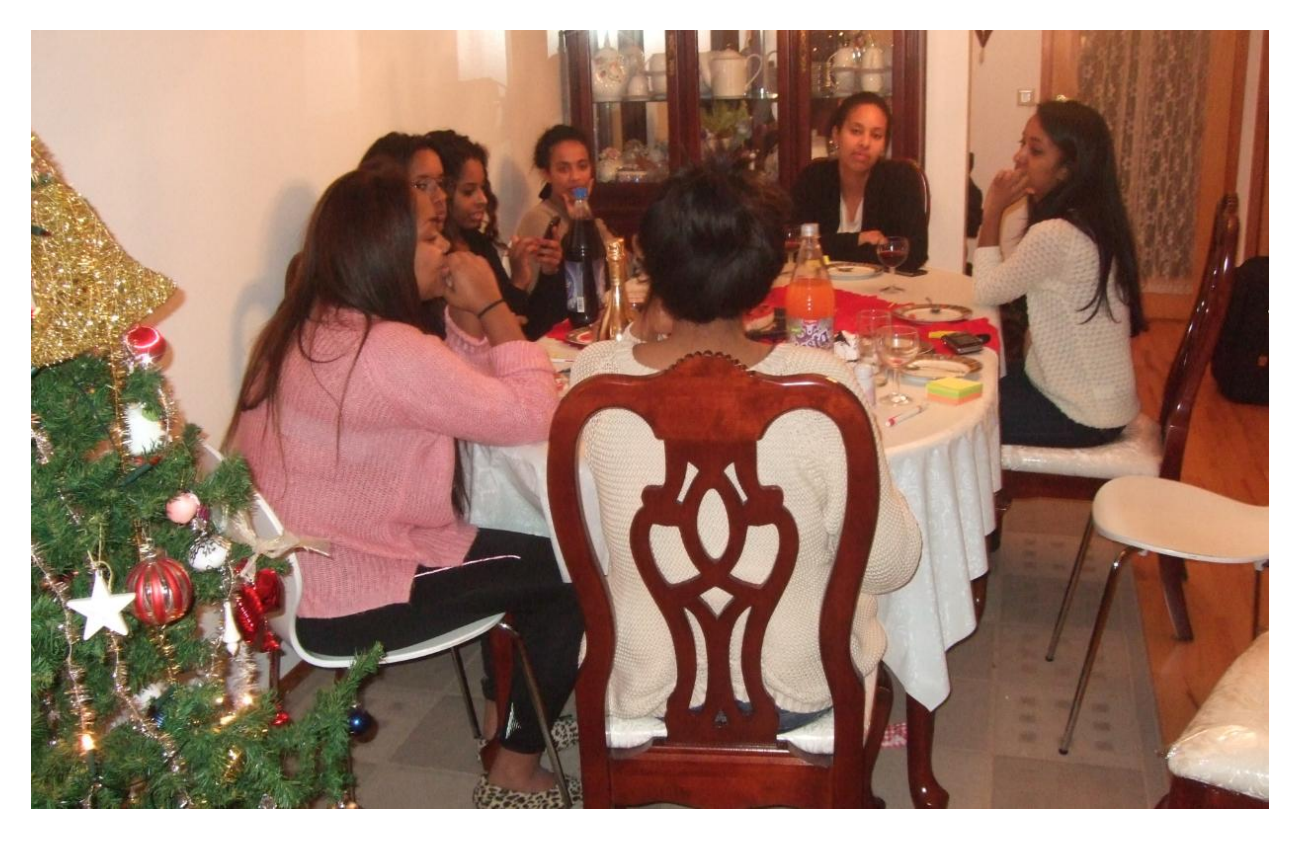
All the Tesfay cousins in Stavanger in december 2012