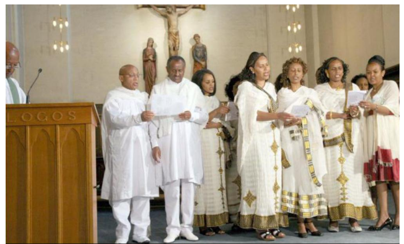
A quire from the Norway branch of the Eritrean Evangelical congregation singing