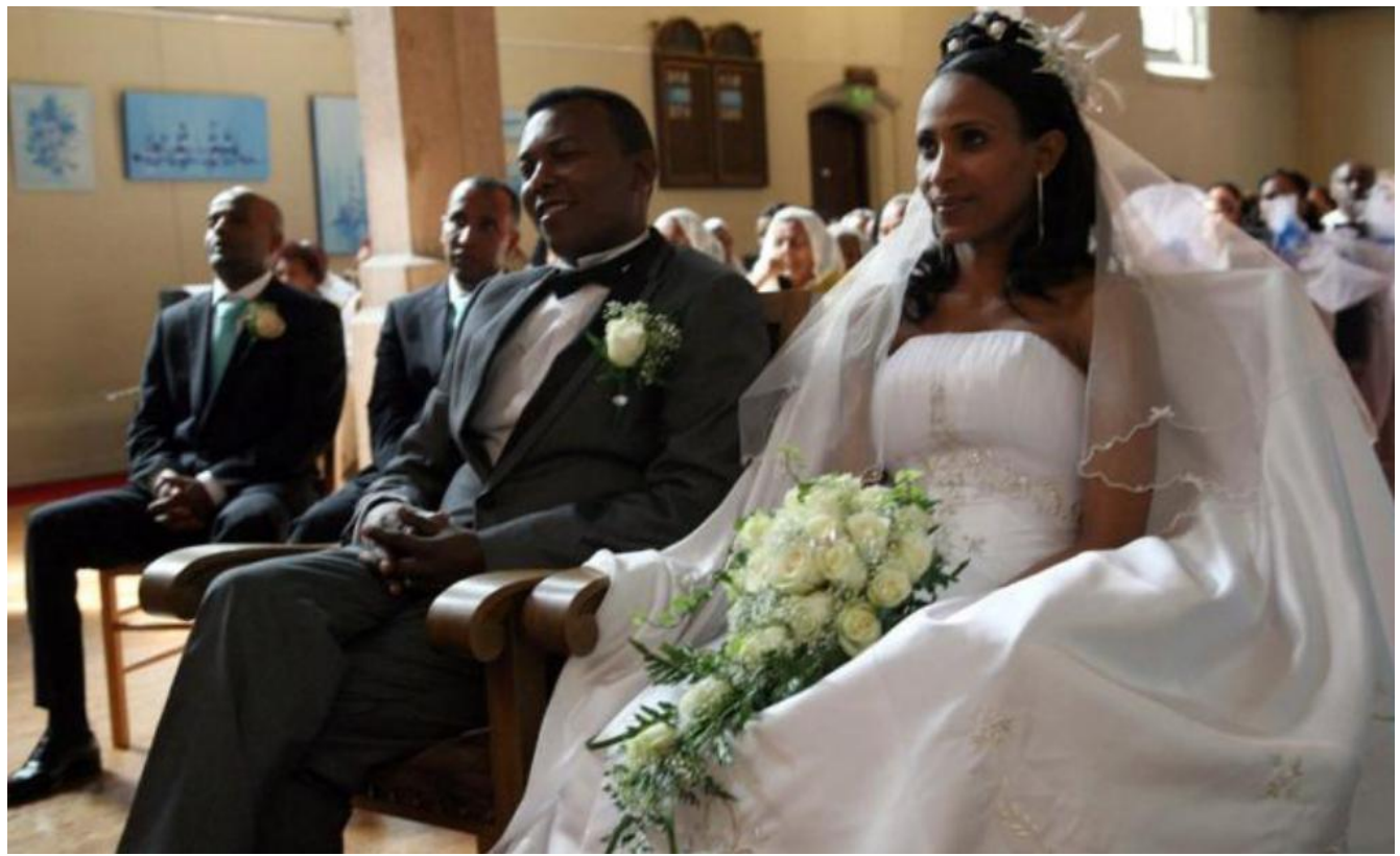
The bride and bridegroom preparing to take the oath