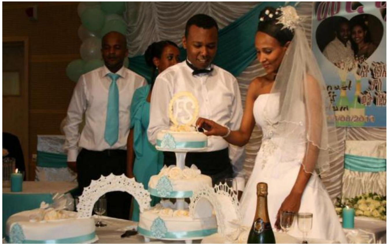
The happy bride and groom cutting the cake