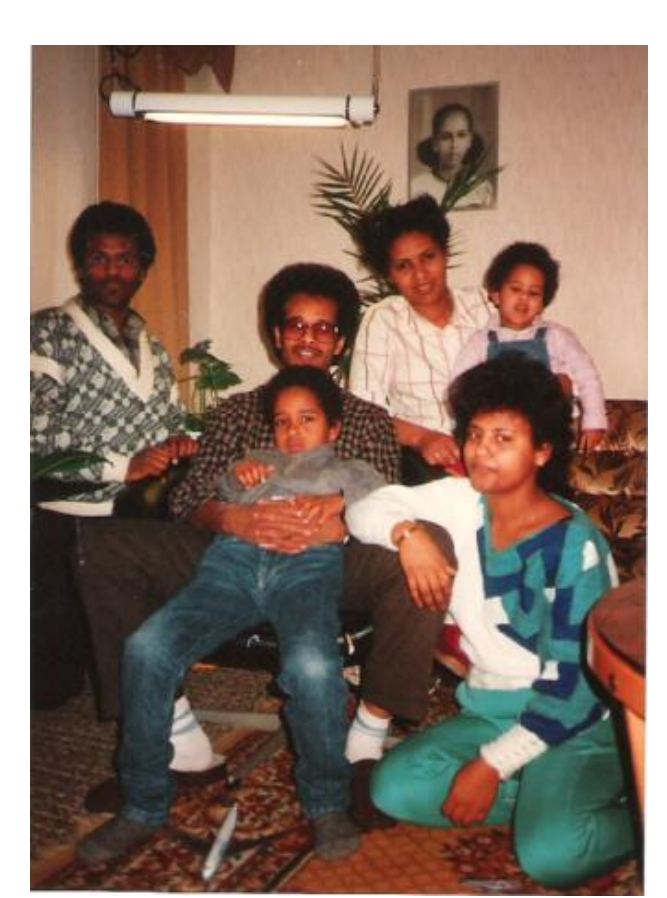
The Gideons hosting the new amiches in Oslo