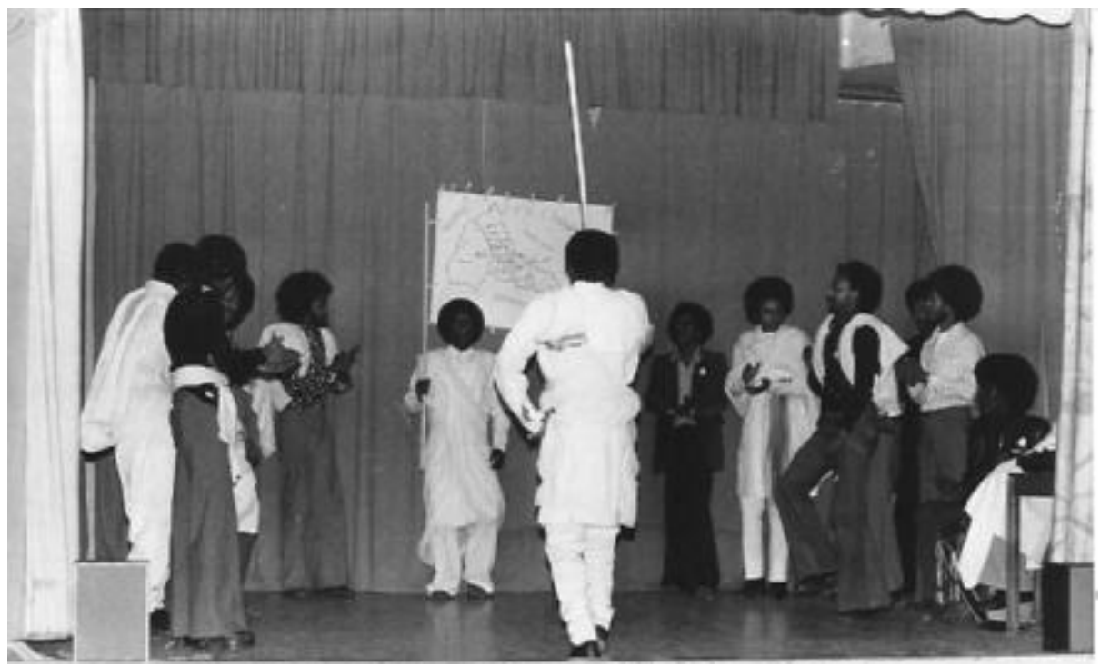
Eritrean cultural show by the members of the newly formed mass organization in 1976