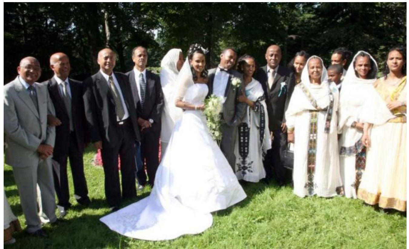
Members of the family and friends surrounding the bride and groom for a snapshot