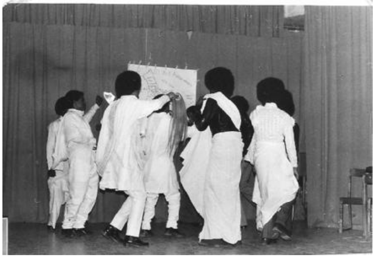
Eritrean cultural show by the members of the newly formed mass organization in 1976