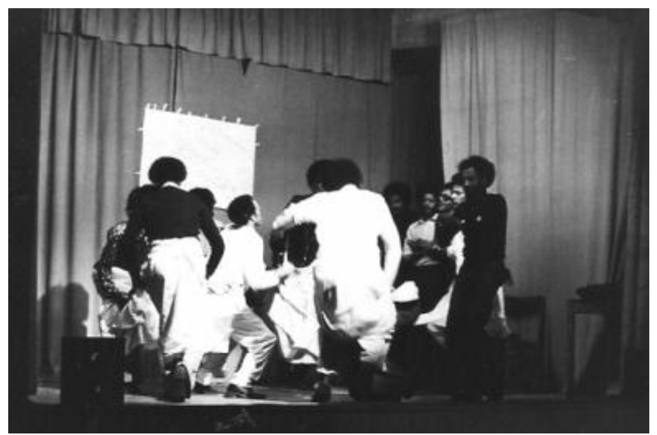
Eritrean cultural show by the members of the newly formed mass organization in Oslo in 1976