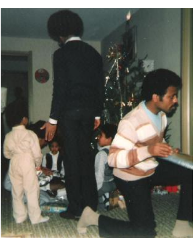
X-mas celebration in Oslo