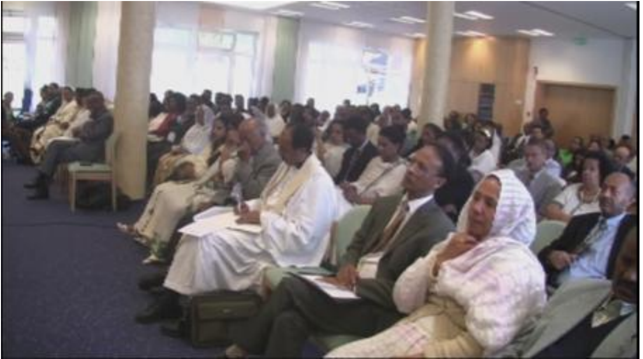
A general view of the congregation