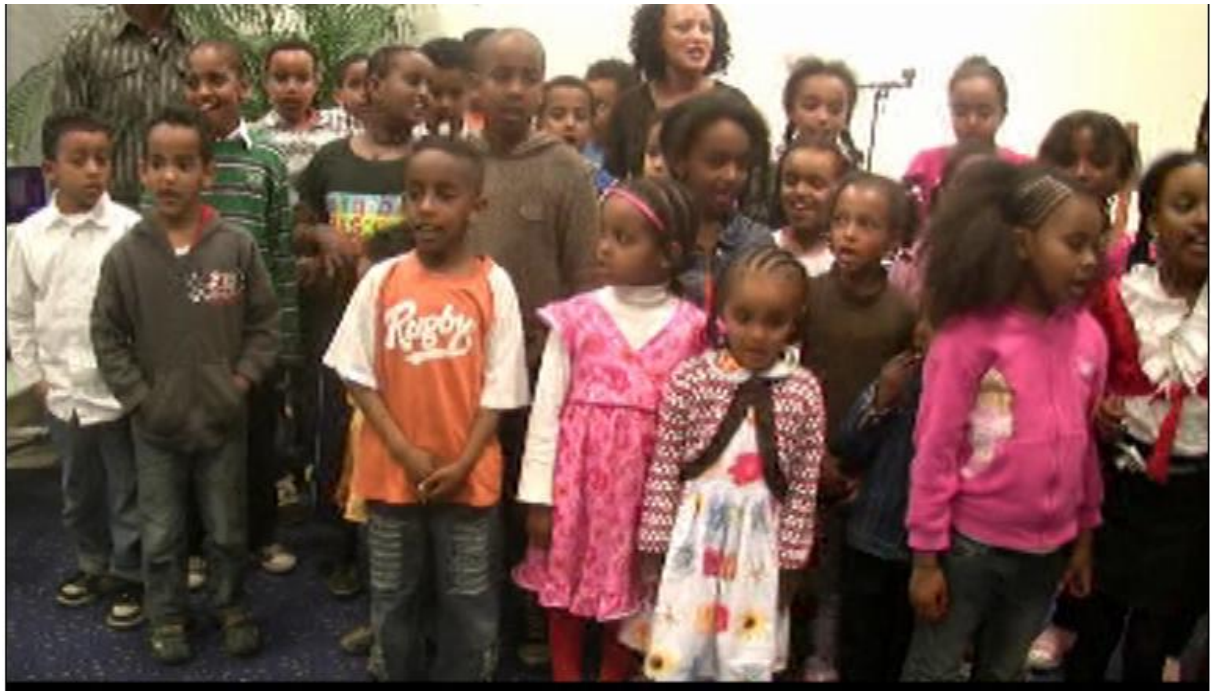
The children group singing