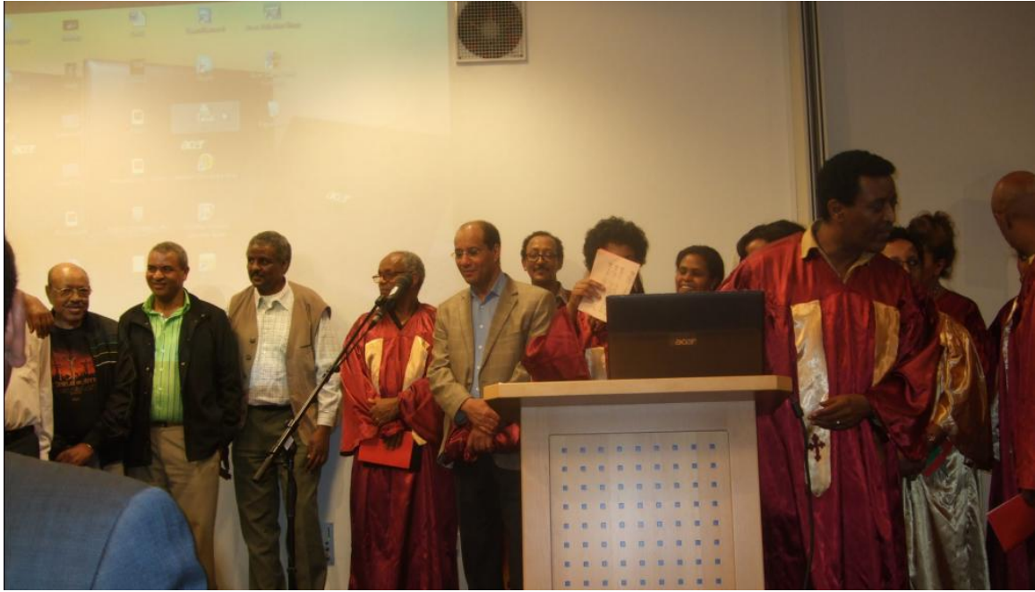
The group from Germany