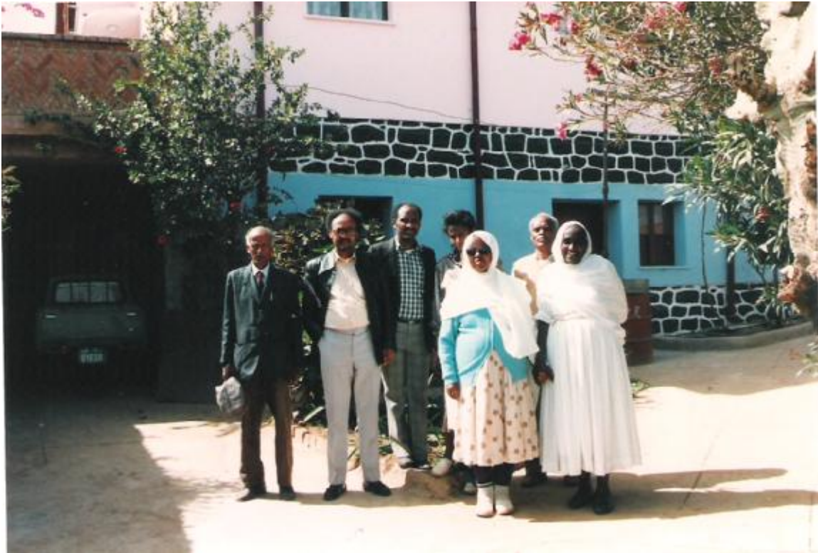
With the Yosiephes in Mendefera