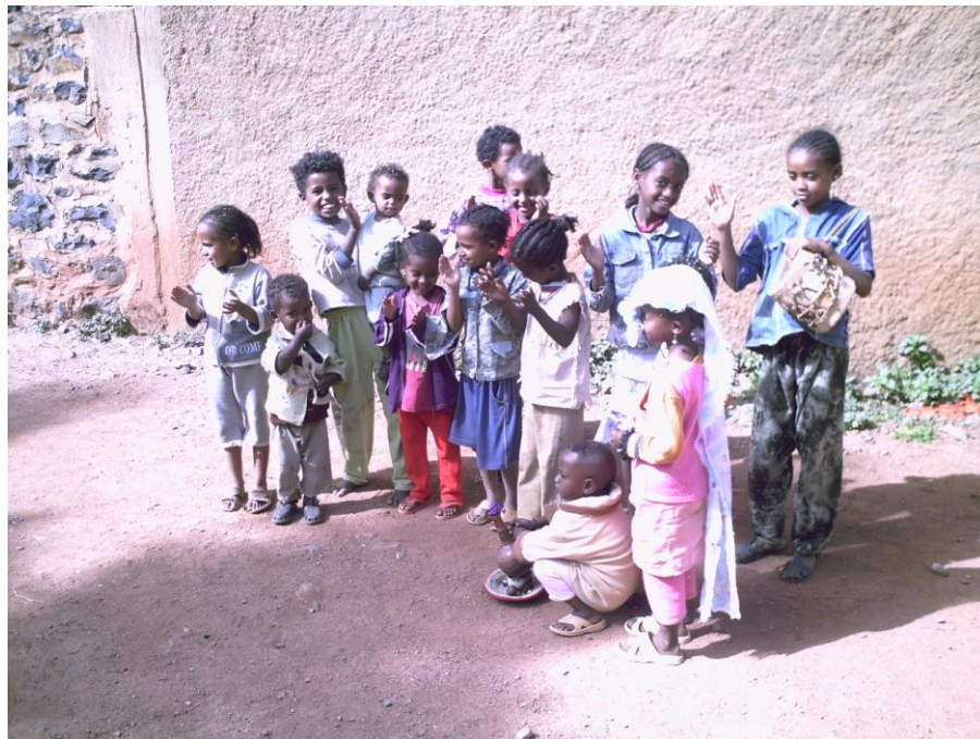
Children from the neighborhood in Adi Bari