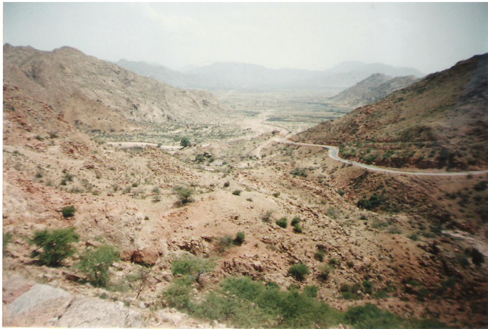
Asmara to Mendefera road