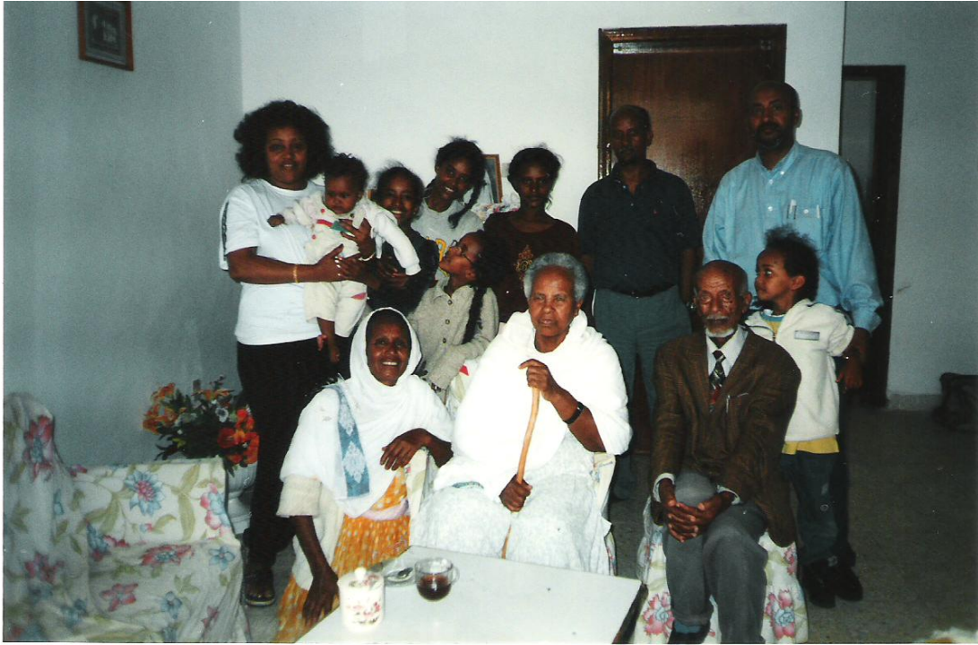
The Emnetus and Mussies with their children in Mendefera