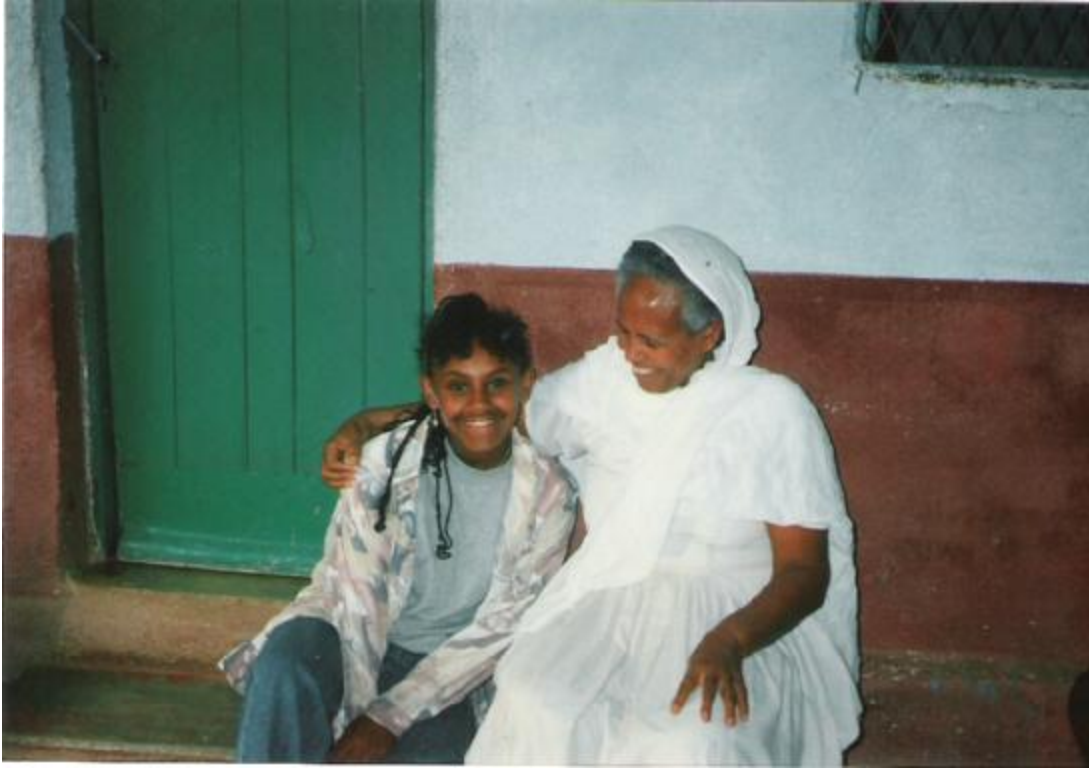
Feben with mother