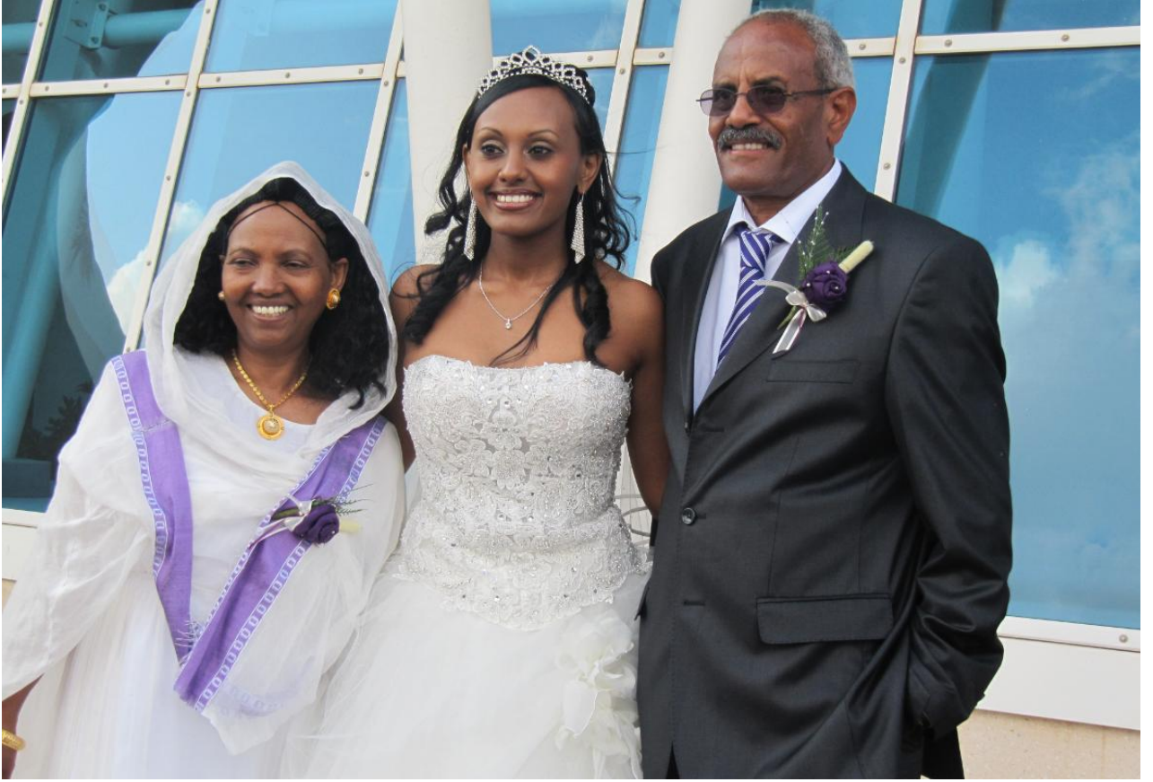
The happy parents posing a photo with the bride