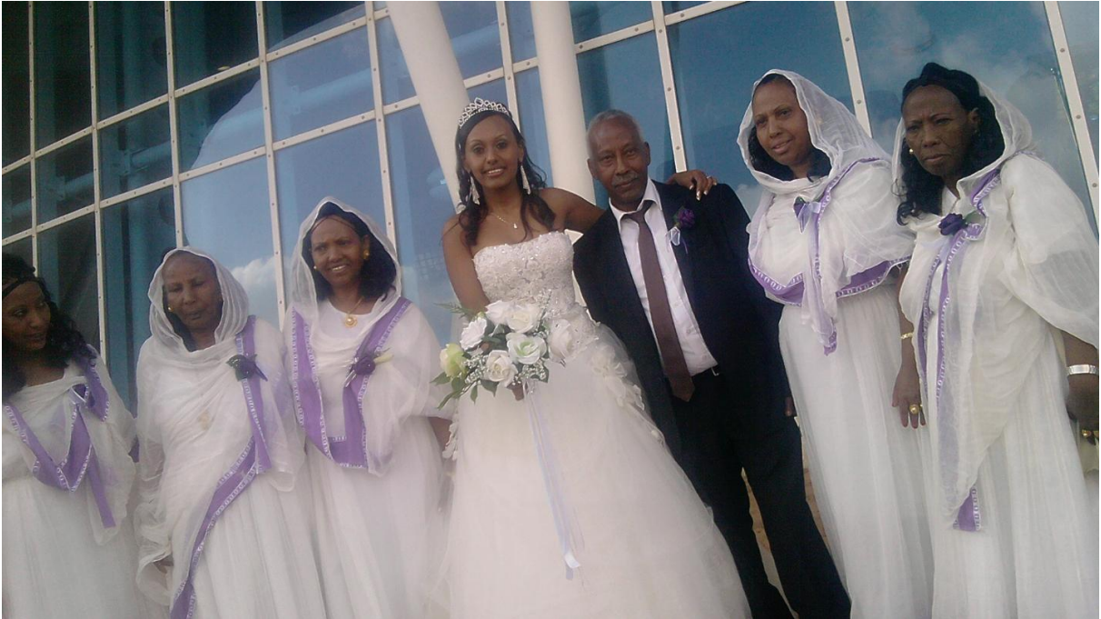
The proud bride with her uncle and aunts