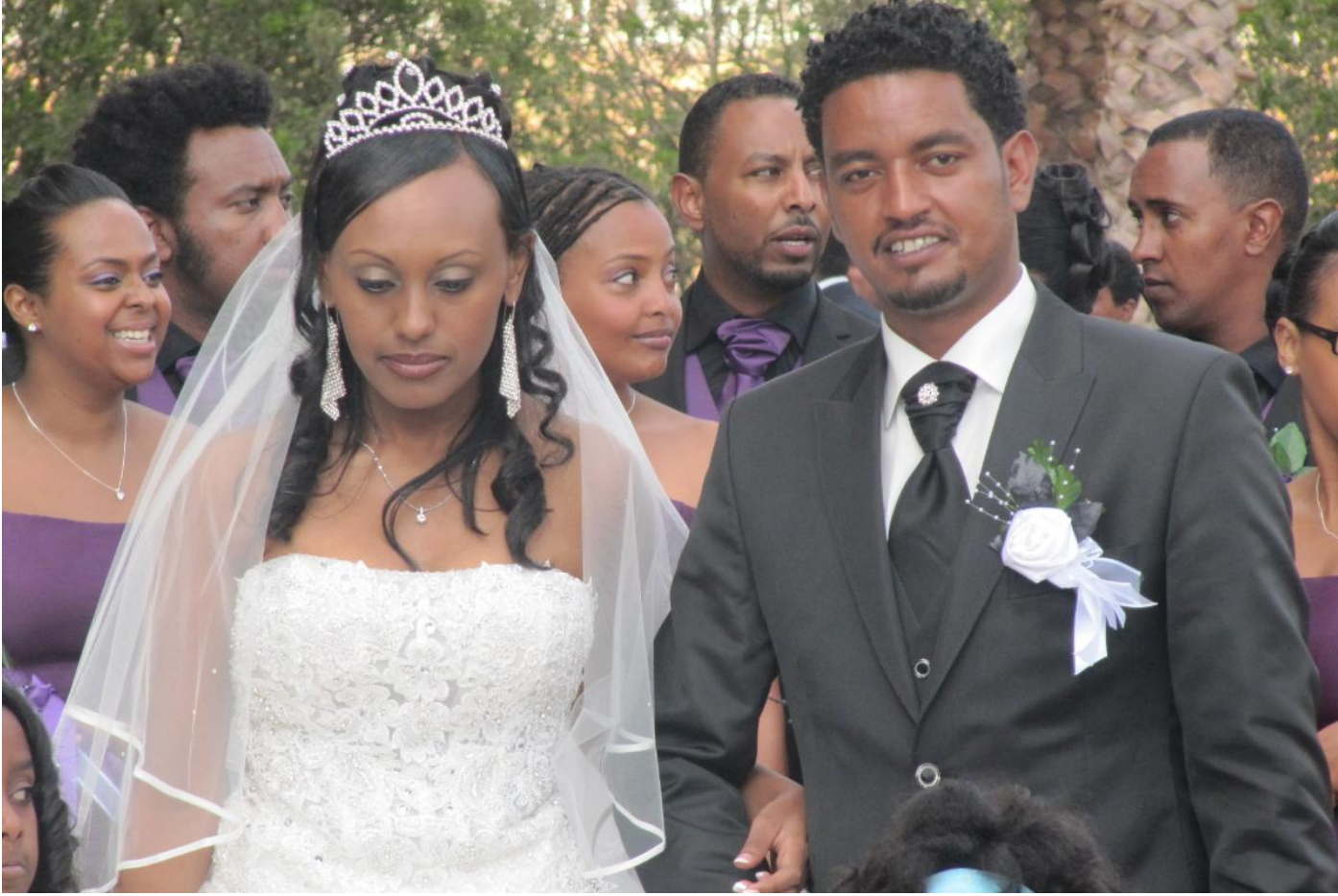
A snapshot of the bride and groom