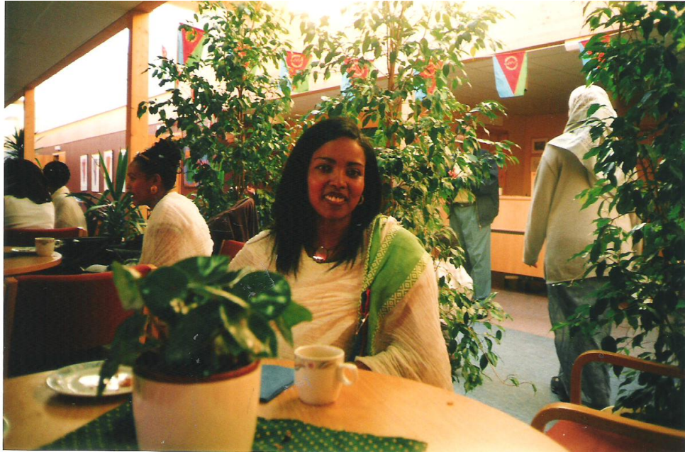
Teabi in Asmara