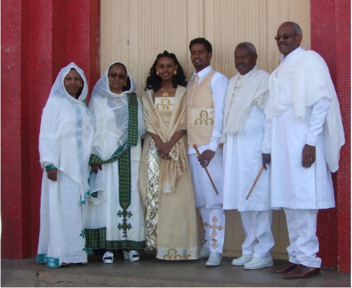
The happy bride and groom joined by their delighted parents