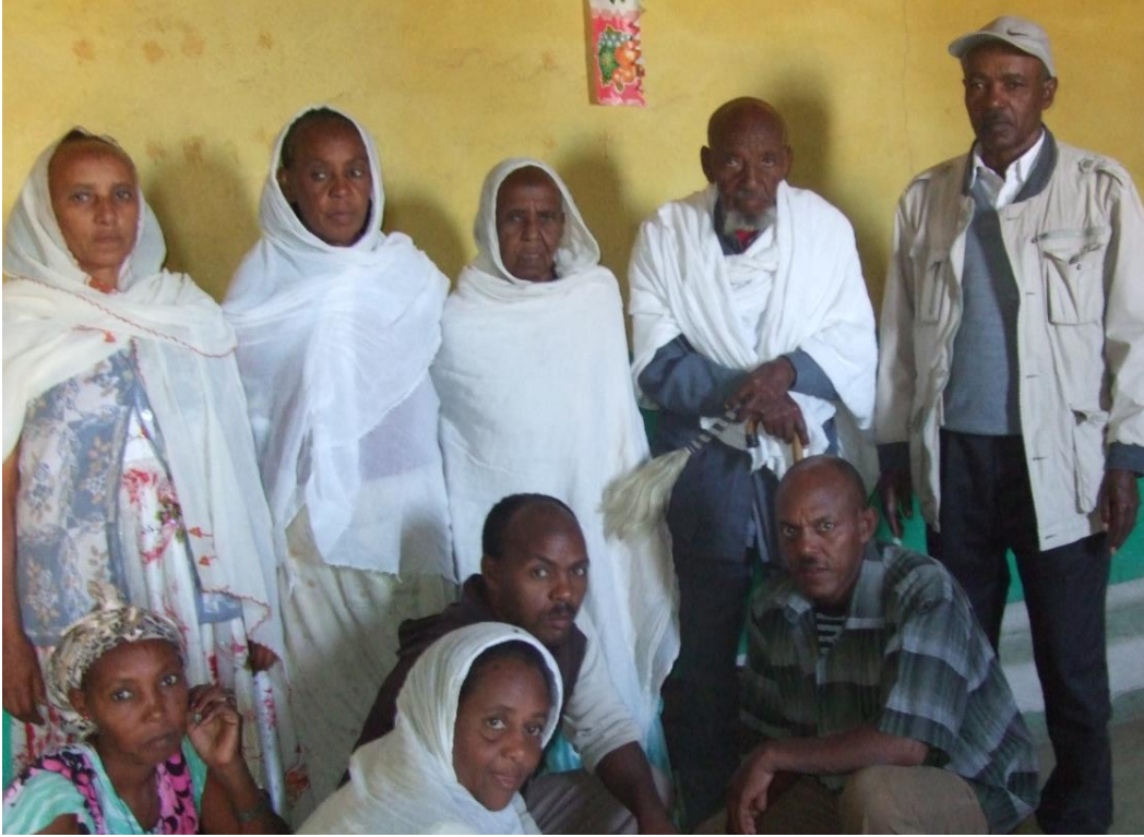
Another snapshot from Semasem