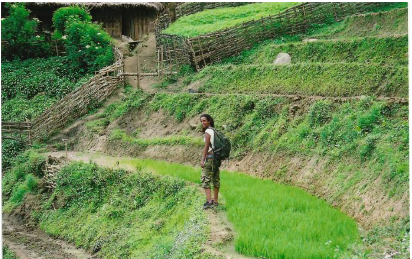
Visiting a rice farm near the Chinese border