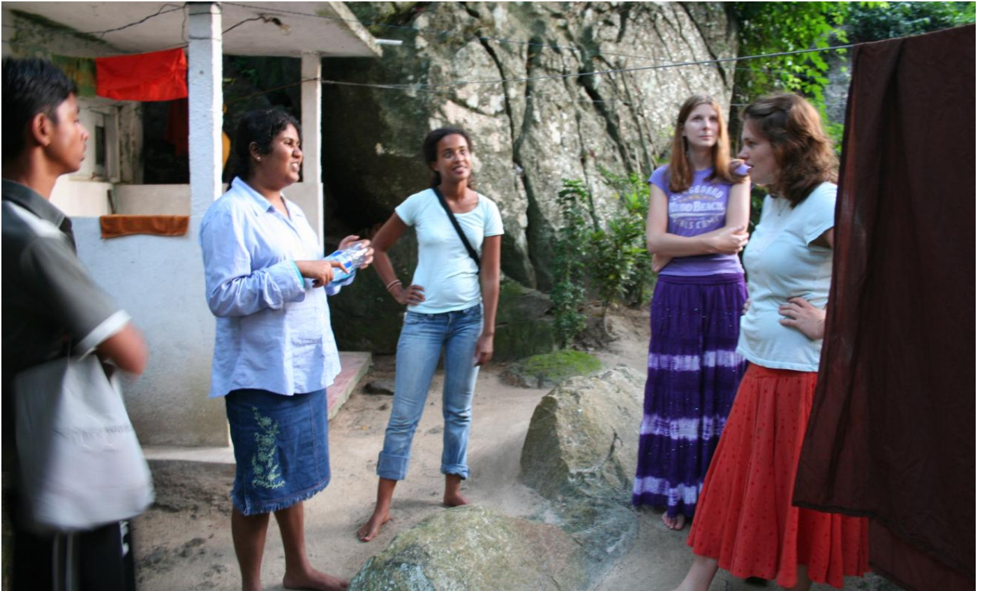
Another picture of hosts and guests