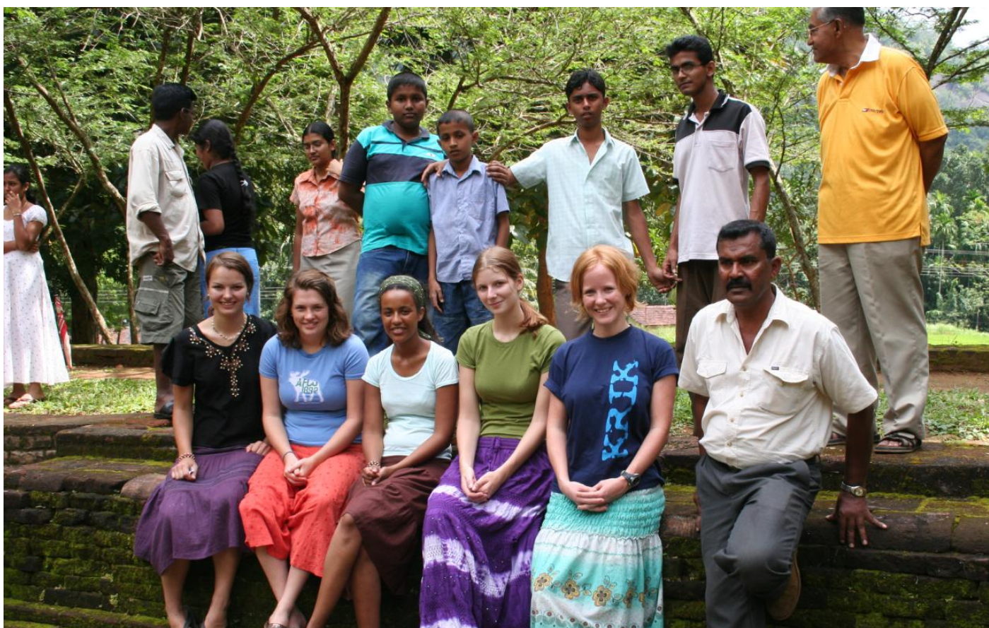
Norwegians and Sri Lankans at a project site