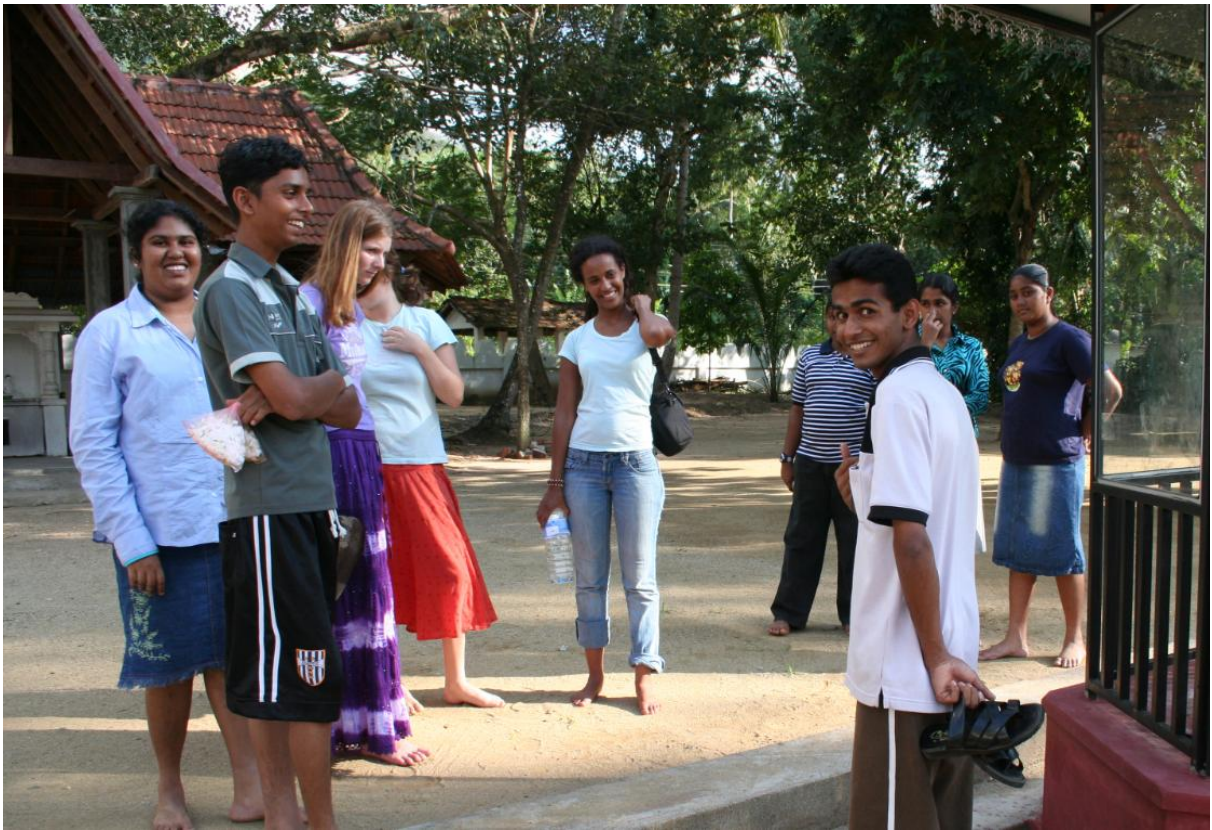
Hosts and guests