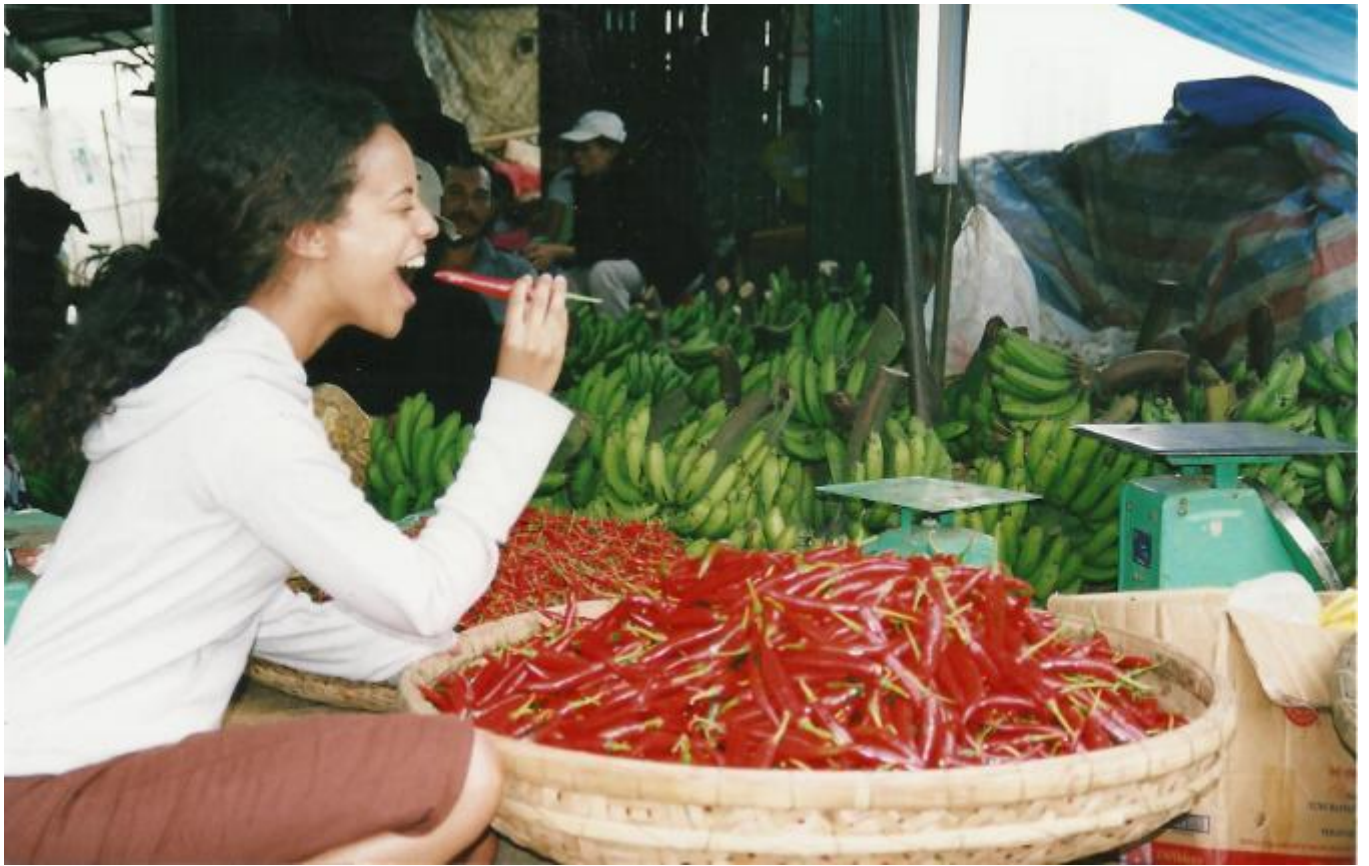
Tasting a fresh chili in Hanoi open air market