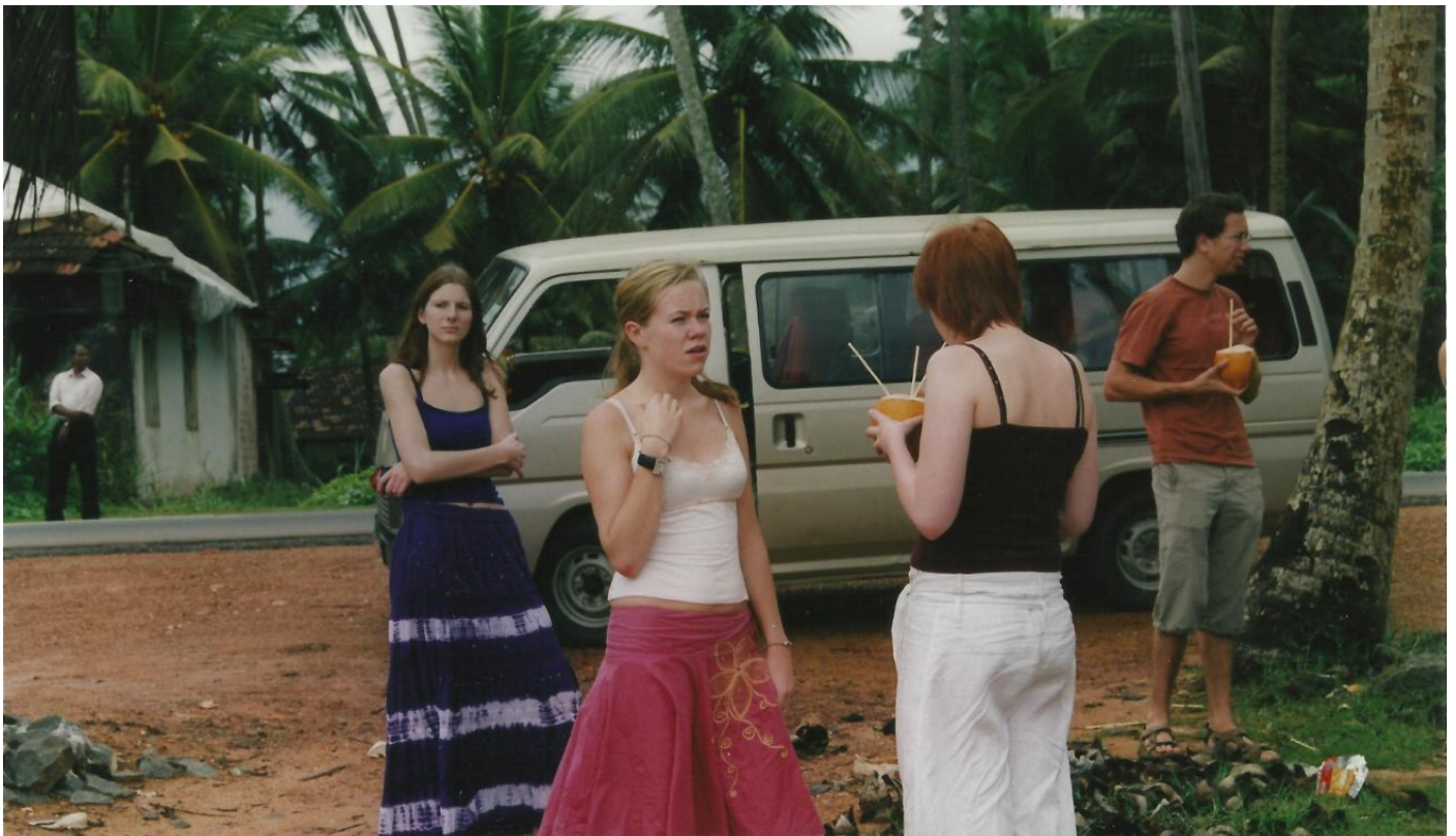
Classmates drinking coconut juice with pipe