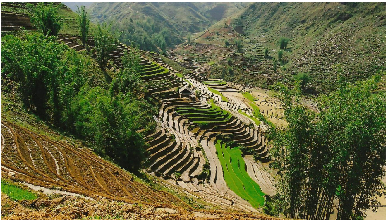
A beautiful rice farm on a mountain side