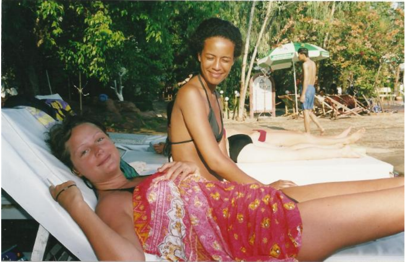
In the sea shores of Nha Trang