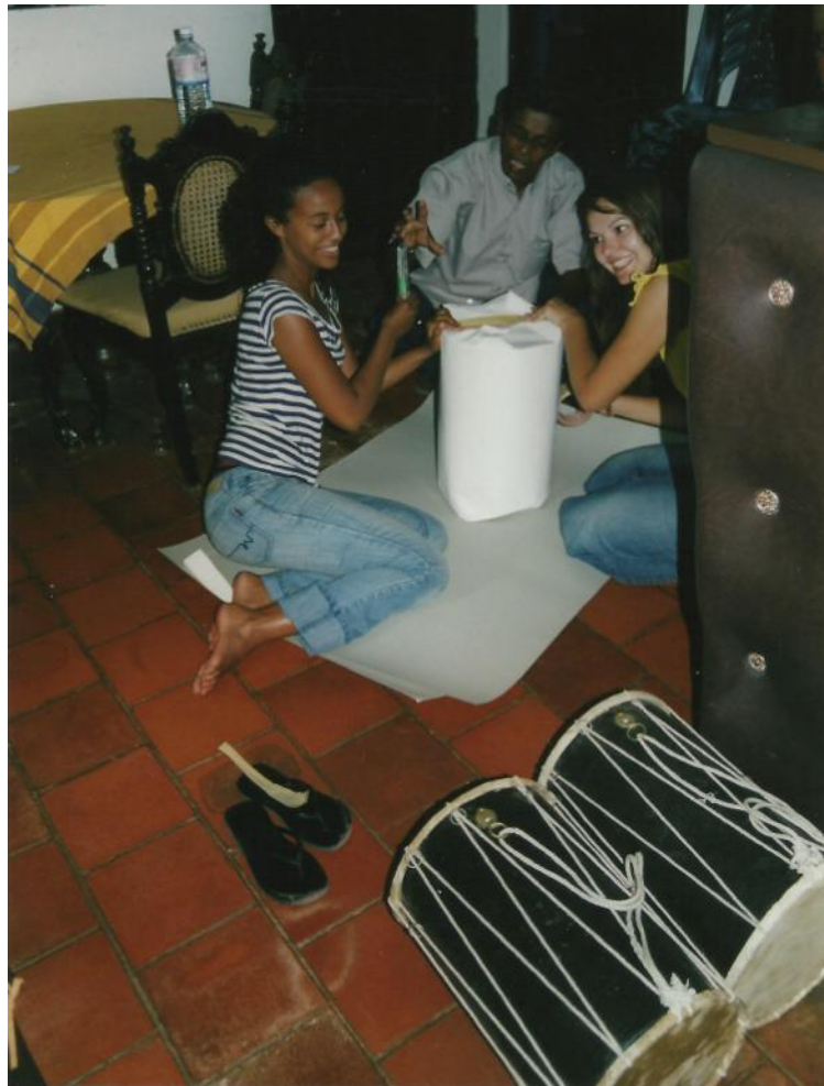
Packing drums for a long journey to Norway