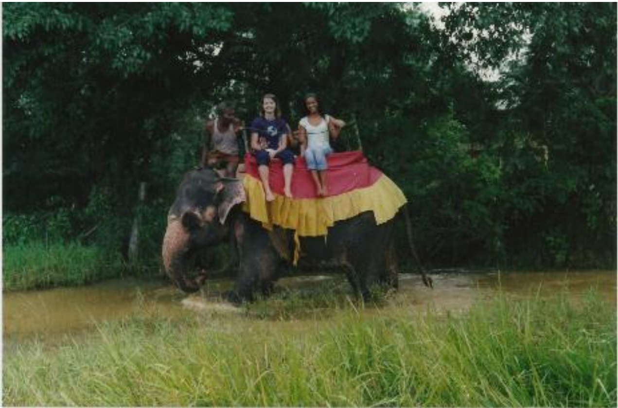
Crossing a river with the help of an elephant