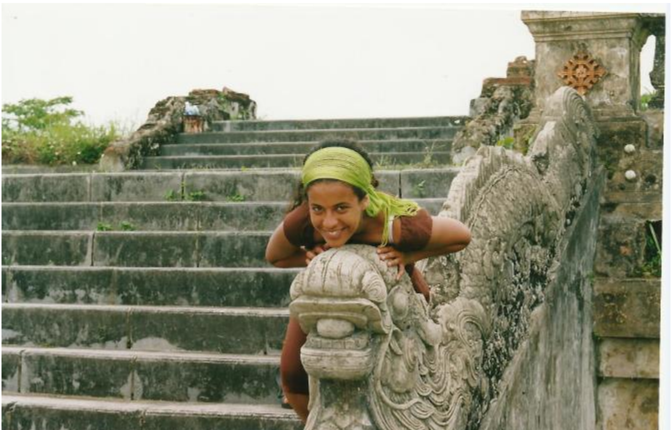
The forbidden city in Hue'