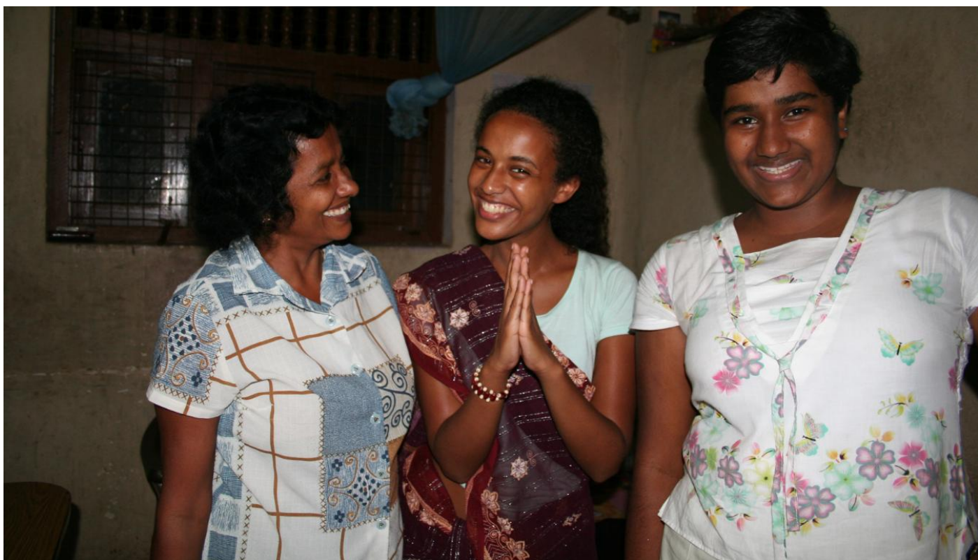
Dressed in national costume