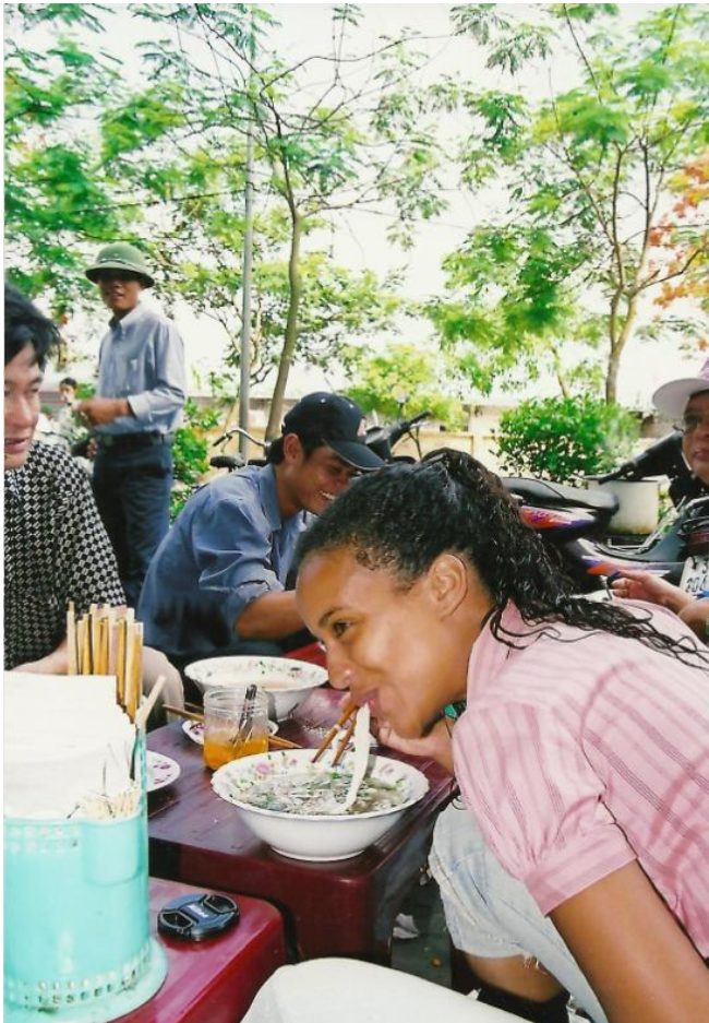
a typical breakfast meal in Hanoi