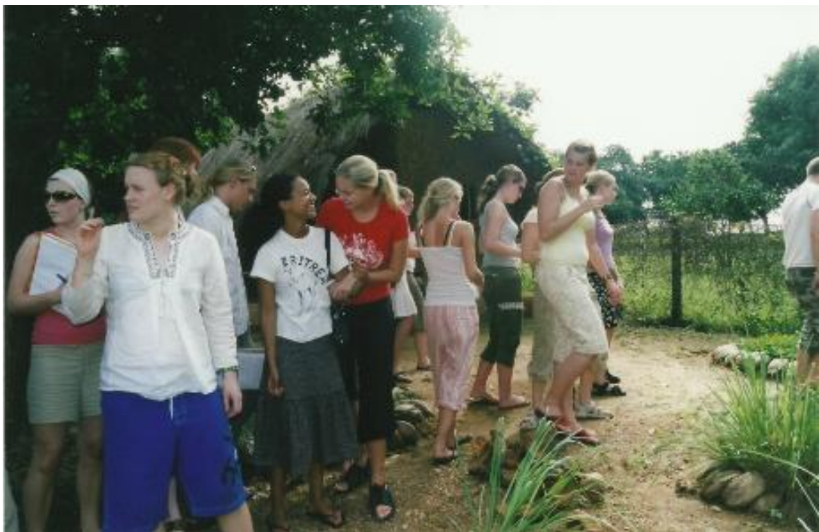
Picnicking with classmates