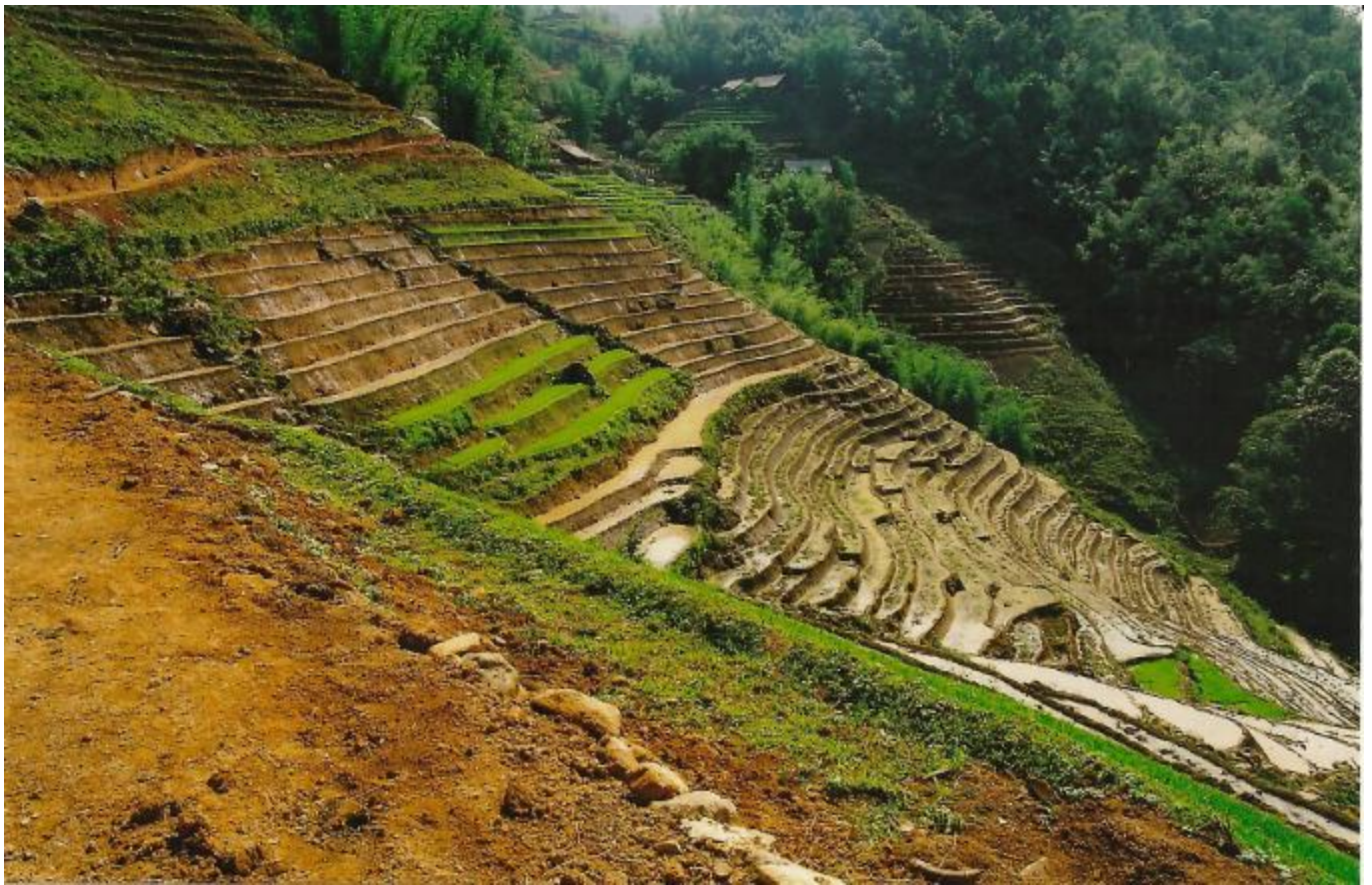
Rice farm on a mountain side in north Vietnam, near the Chinese border