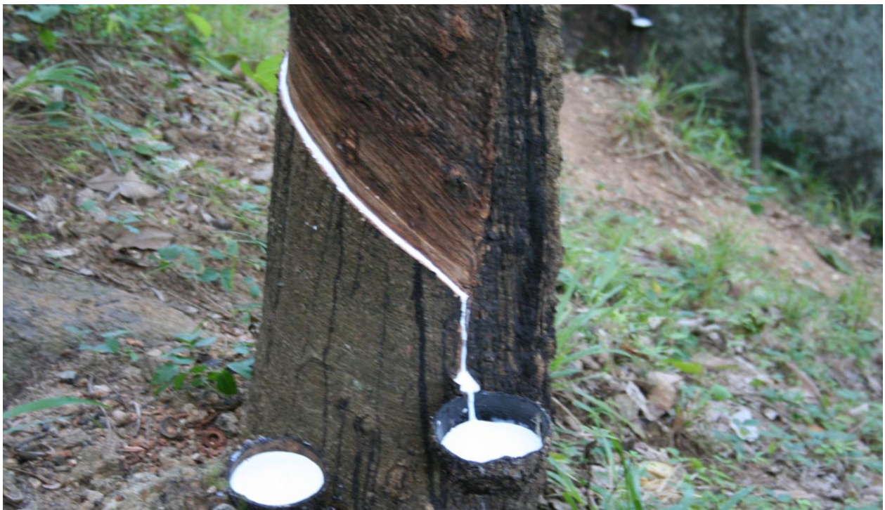
A gummi arabicum tree