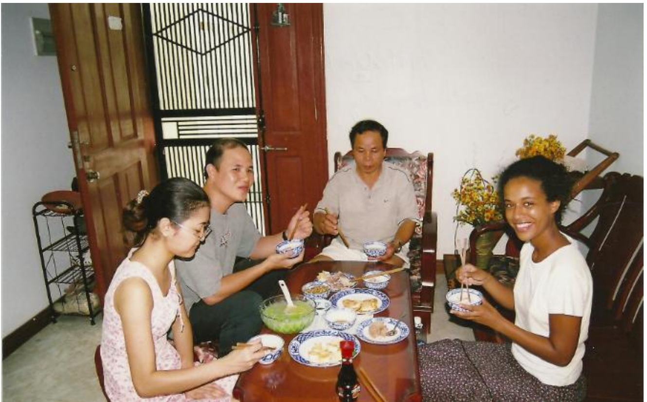
Hosted by a family friend in Hanoi