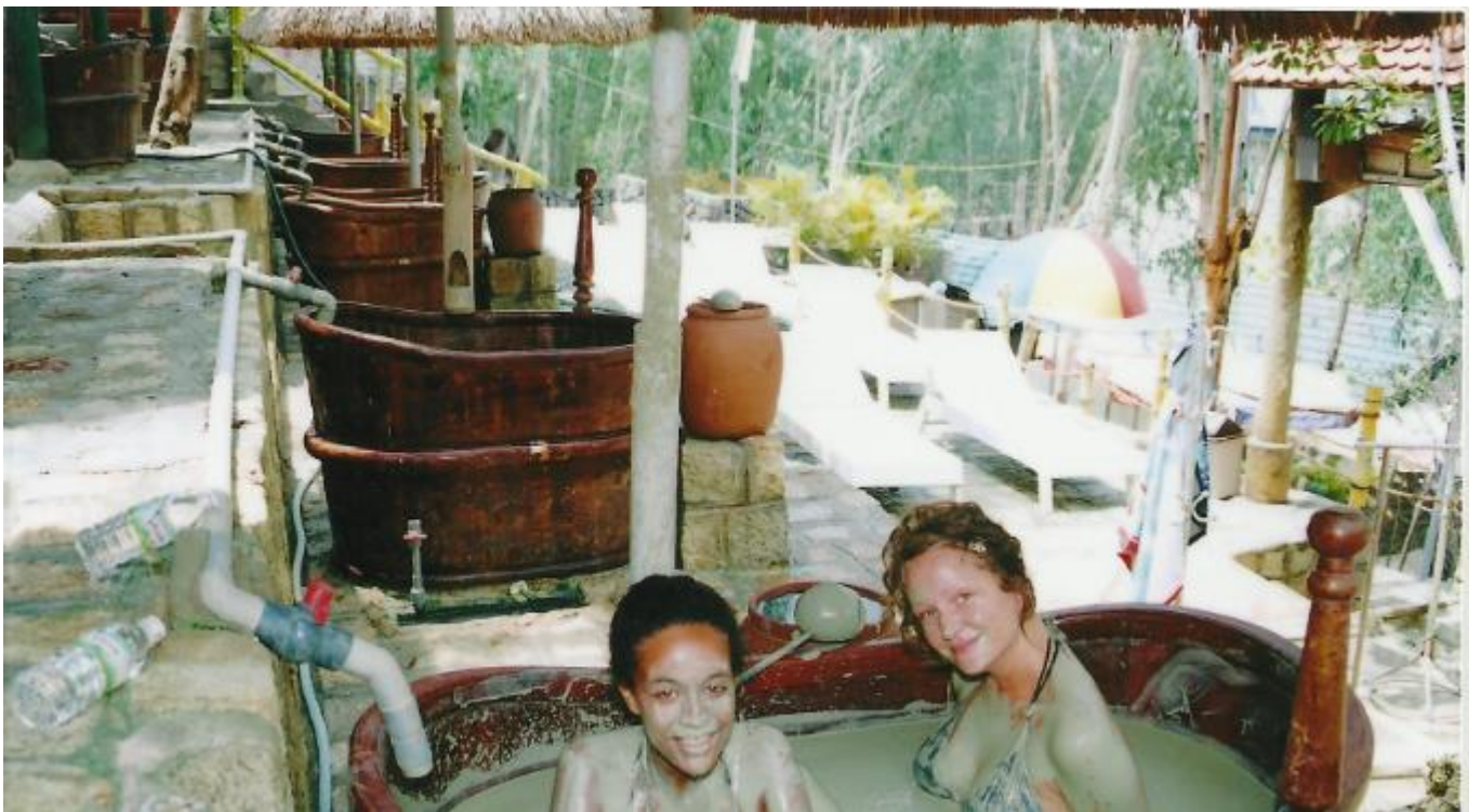
Bathing according to tradition for good health in Nha Trang