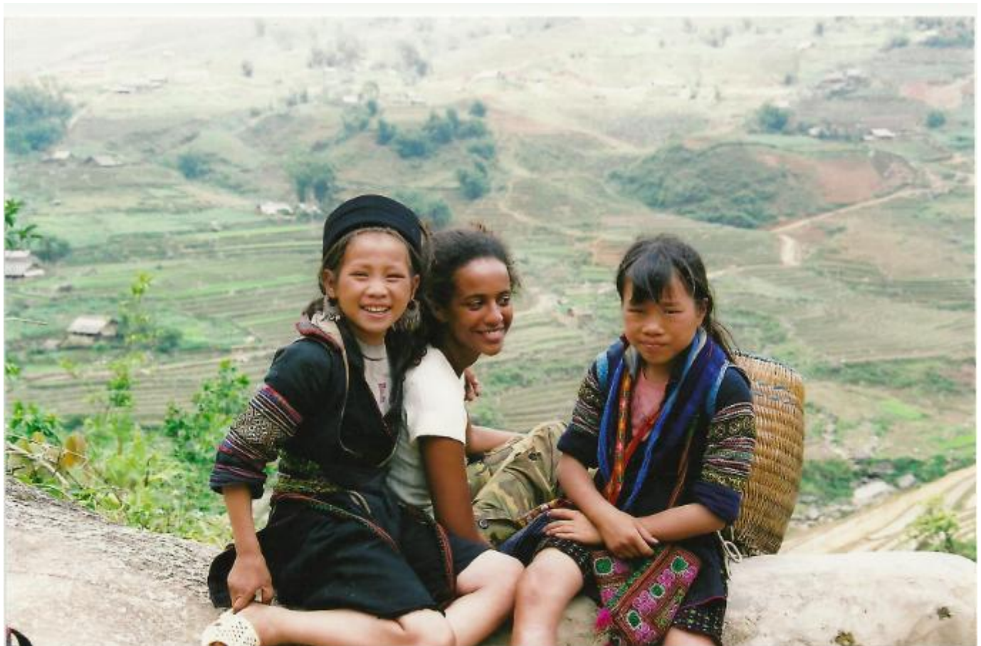
Joining two girls of a rice farming family for pictures