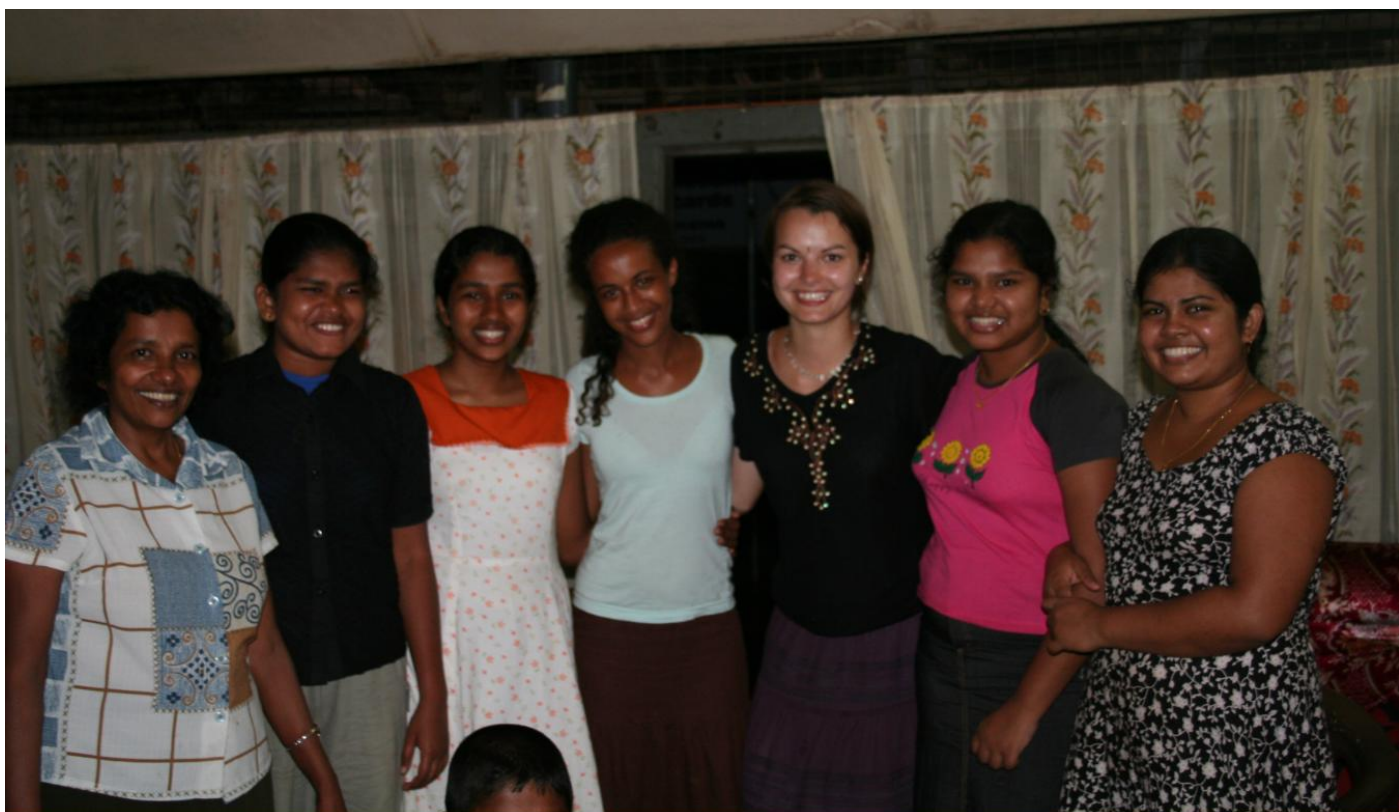
Hosted by a Sri lankan family