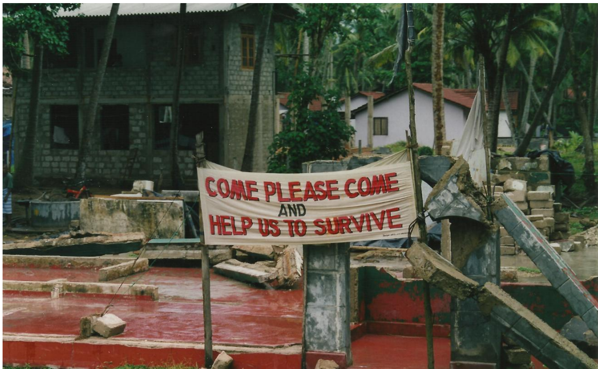
An area hit by the tsunami in 2004