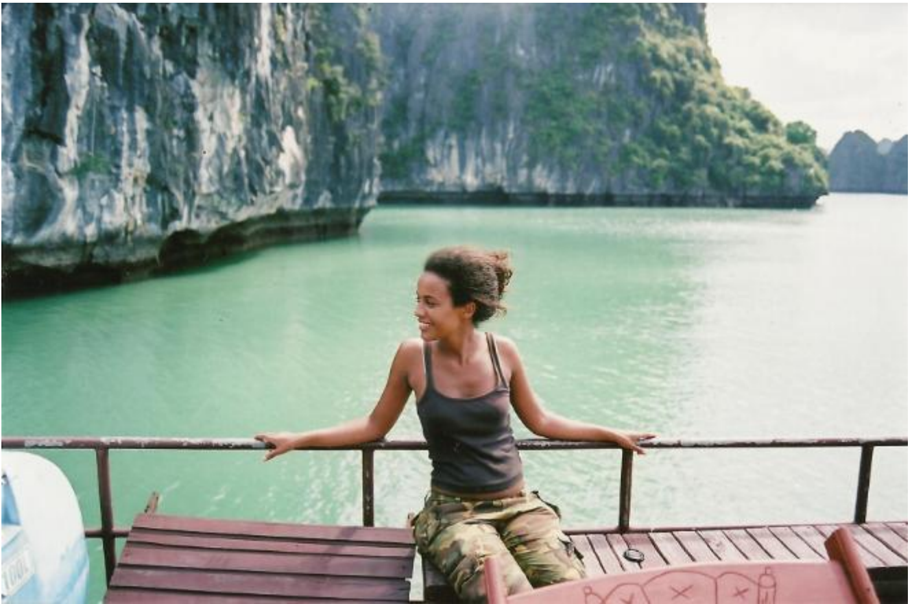
Sailing in the Halong bay