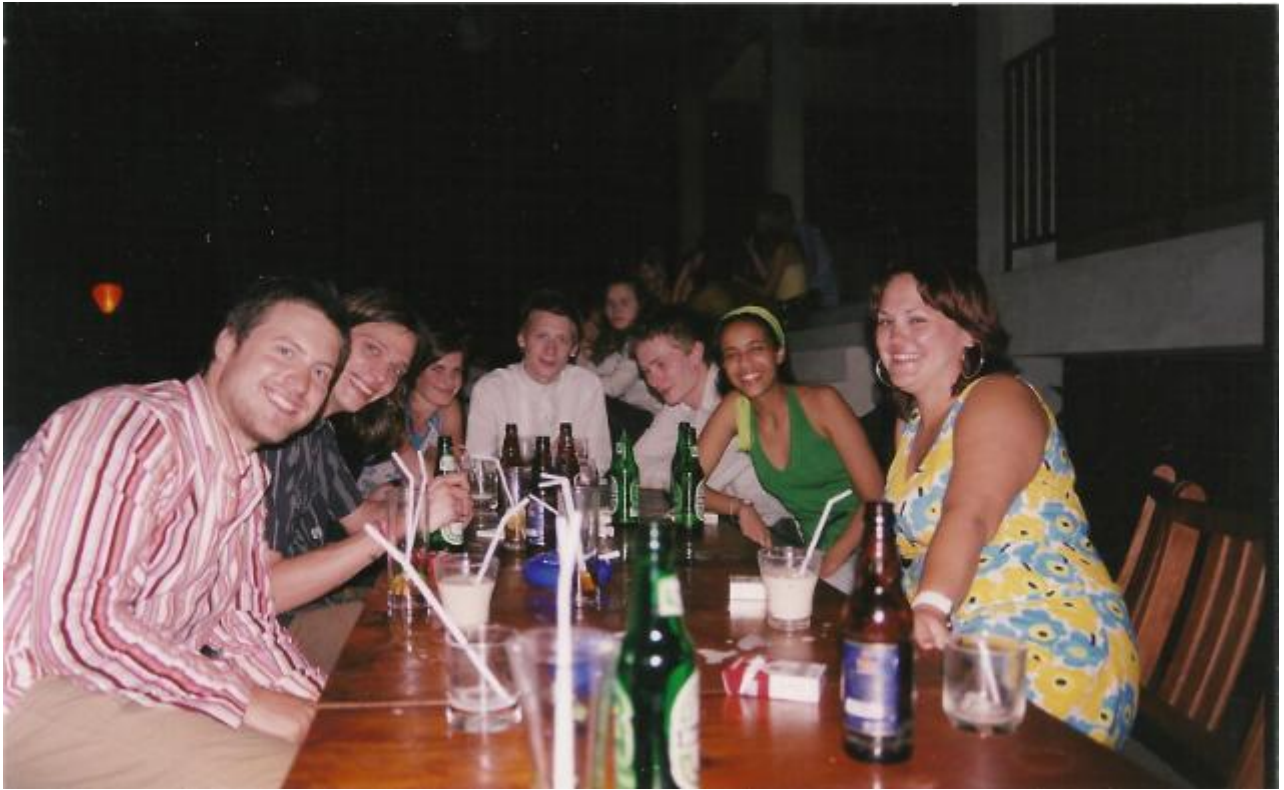
Feasting with classmates from Norway in Hoi An