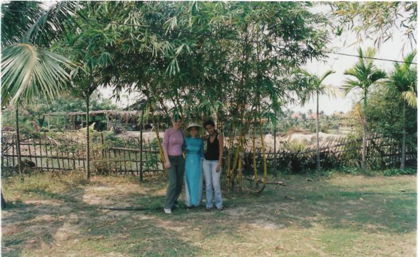
With two classmates in Hoi An