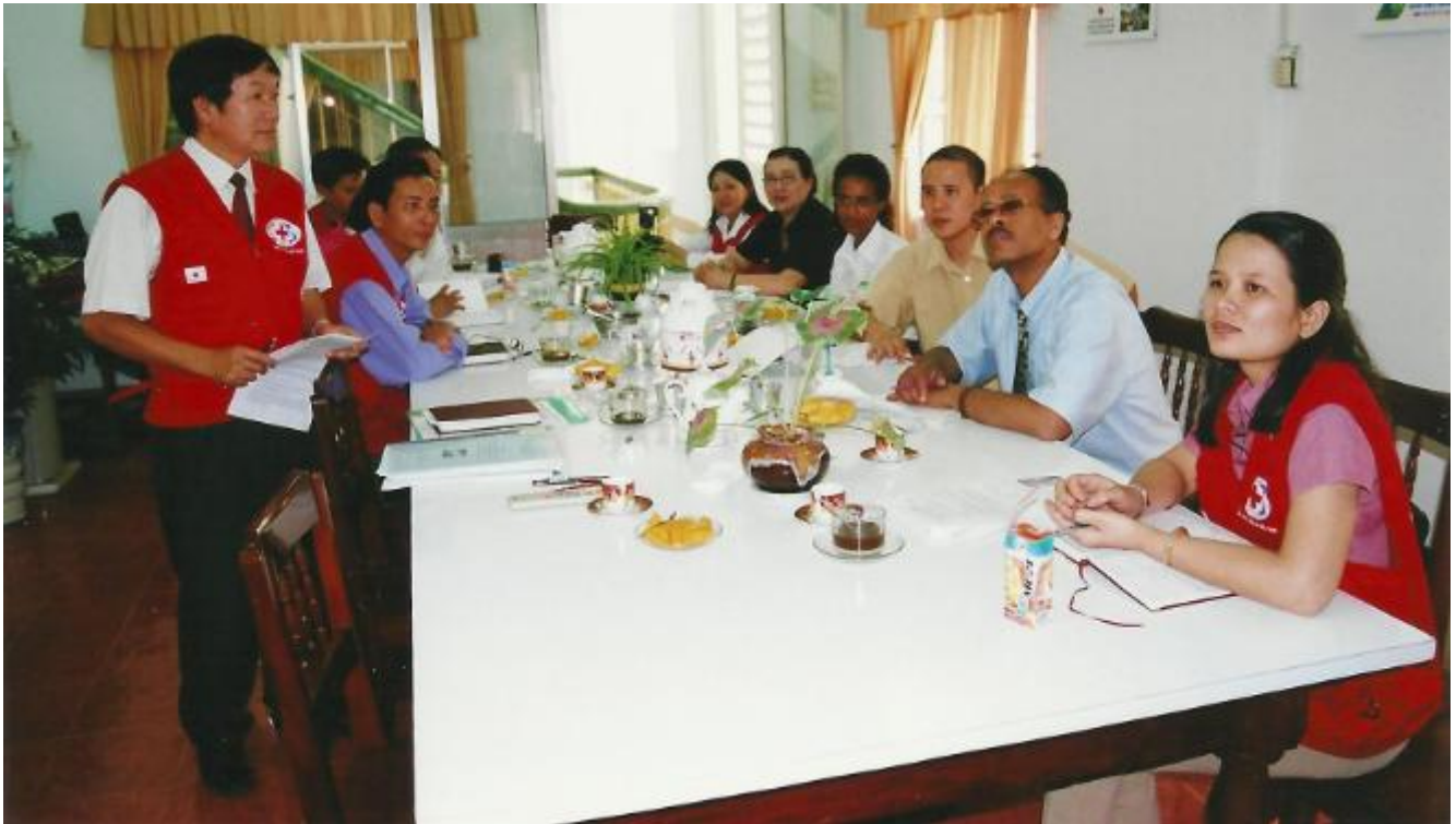
Joining a meeting of the Red Cross in Nha Trang