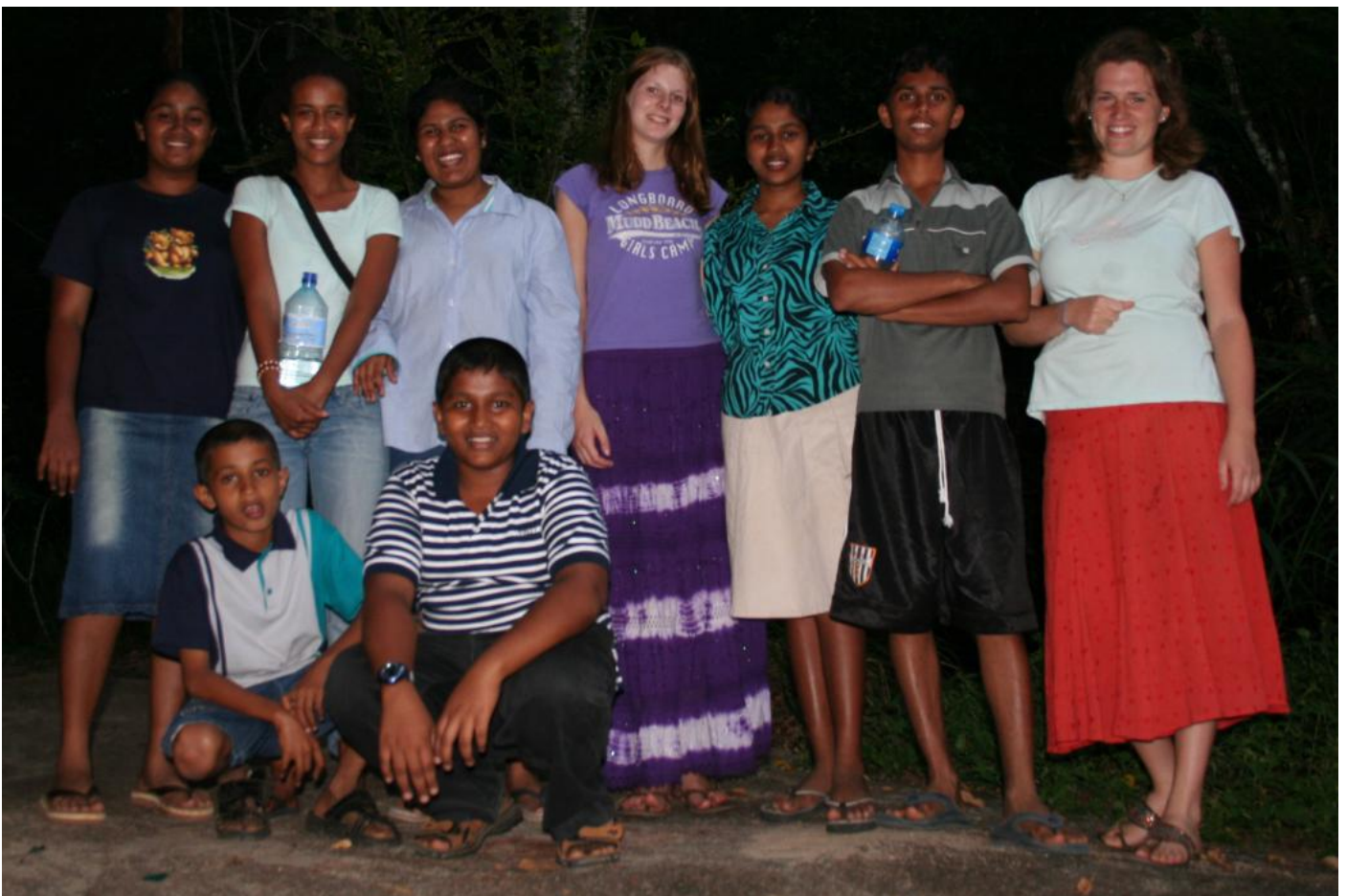
Another picture of hosts and guests