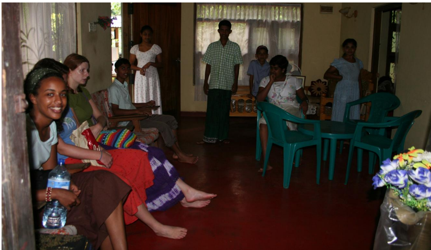
Hosted by a private family