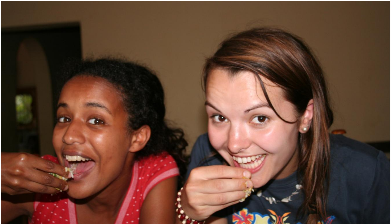
Eating rice with fingers