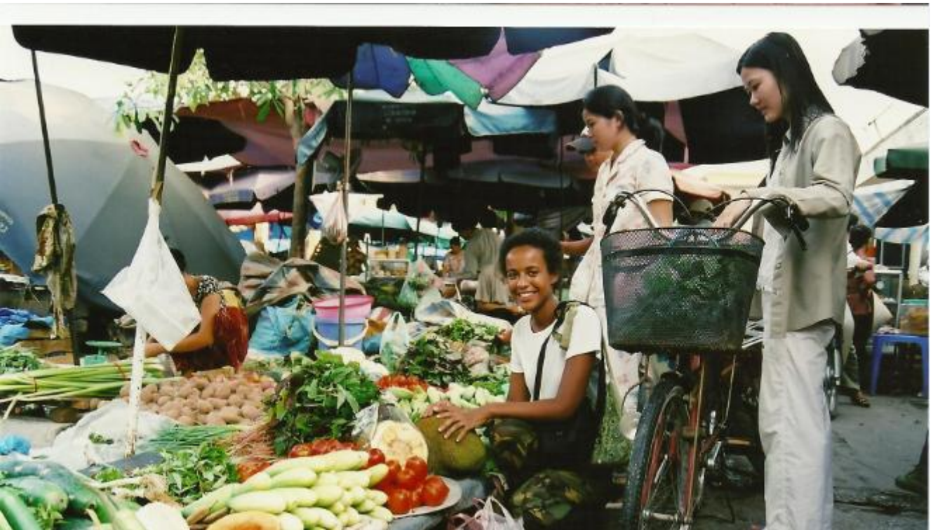
An open market place in Hanoi