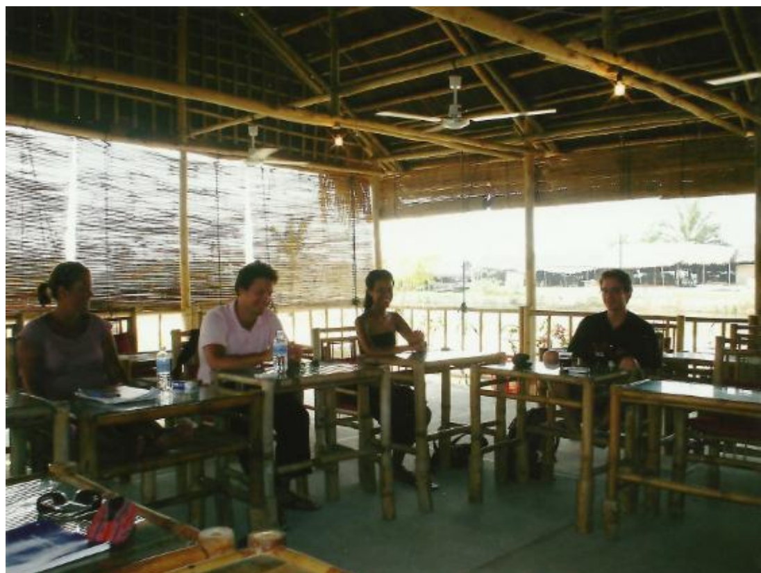
Attending class in Hoi An