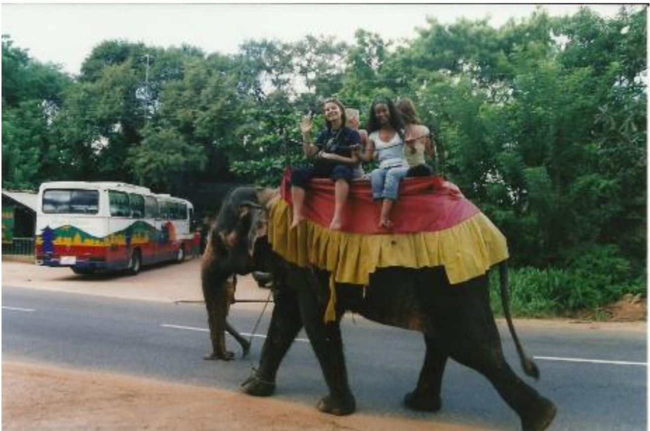
4 students riding an elephant