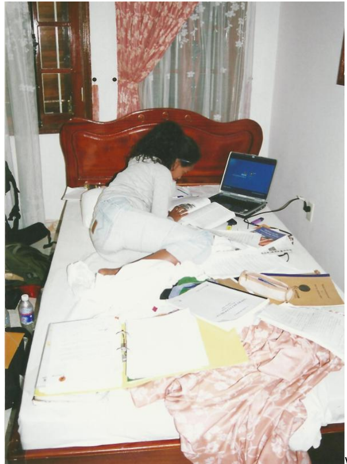
writing the final paper at Hoian