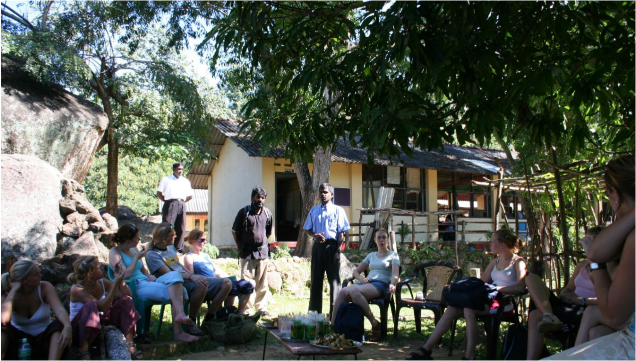
Teachers and students in informal chat