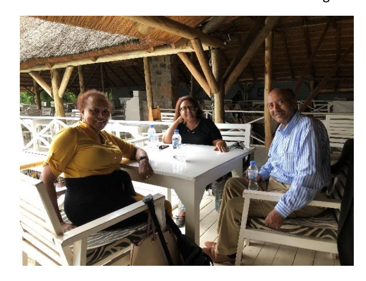
All the pictures in this page are at Pili Pili, a restaurant near Nina's guesthouse. Pili pili is a birds eye chilli much stronger than ምዋሚጣ