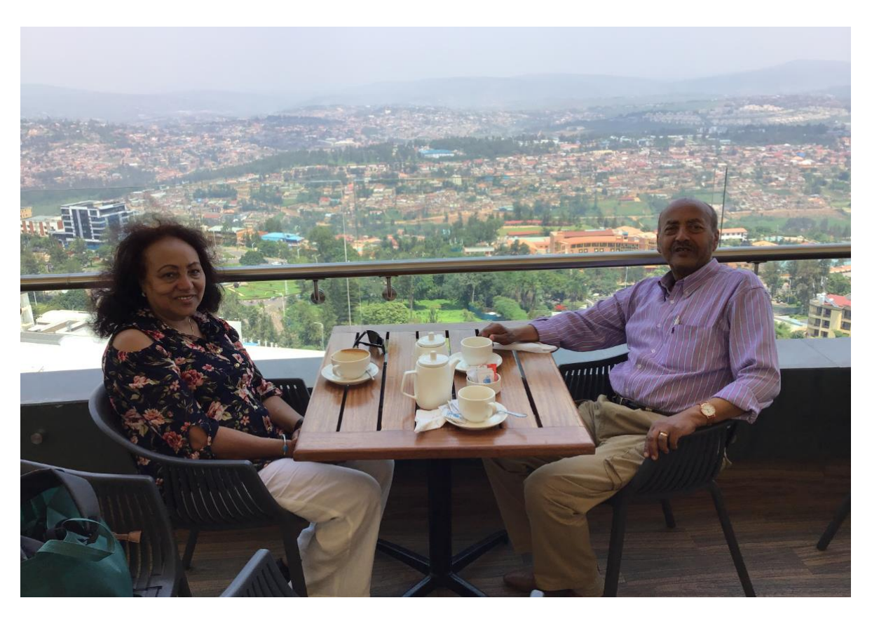
Partial view of Kigale from a the top floor of a high tower