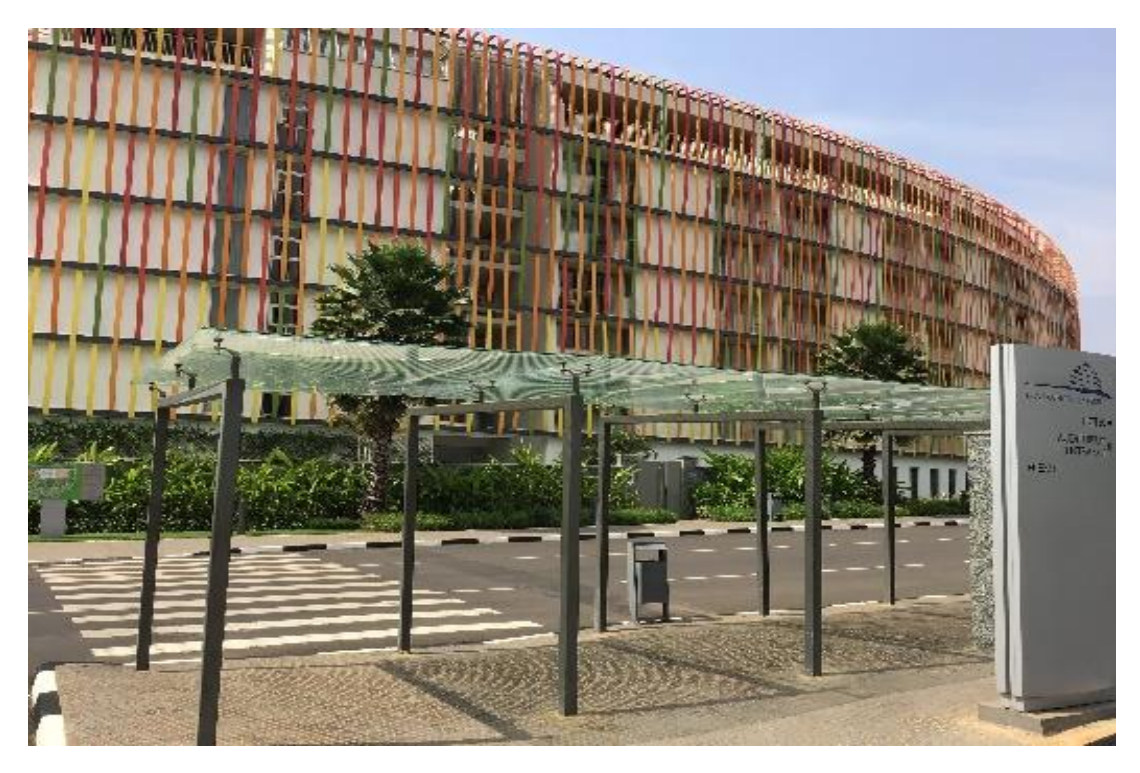
Radisson Blu hotel adjacent to the convention hall