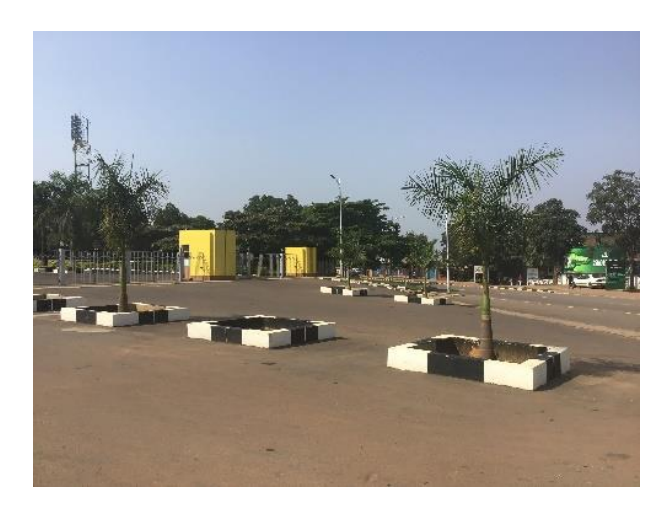
The entrance to the museum compound

The pictures in this page are all from the Rwanda genocide museum. Taking photos inside the museum were not permitted however I have scanned a leaflet and pasted it here.