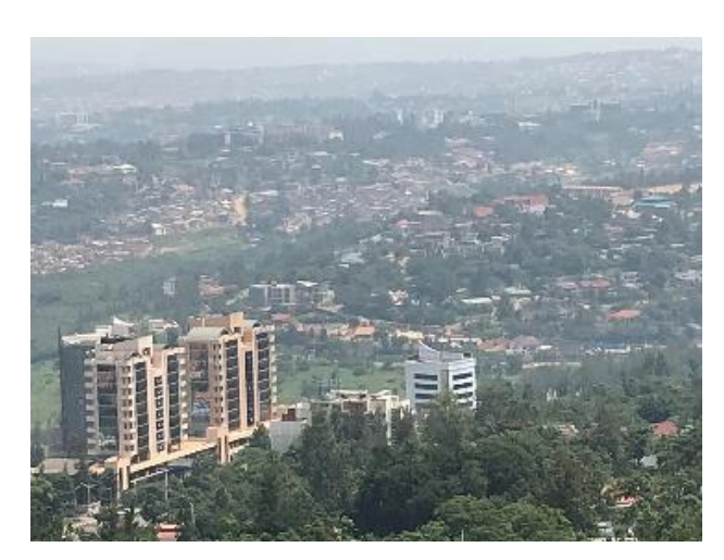
Location of the museum from higher ground