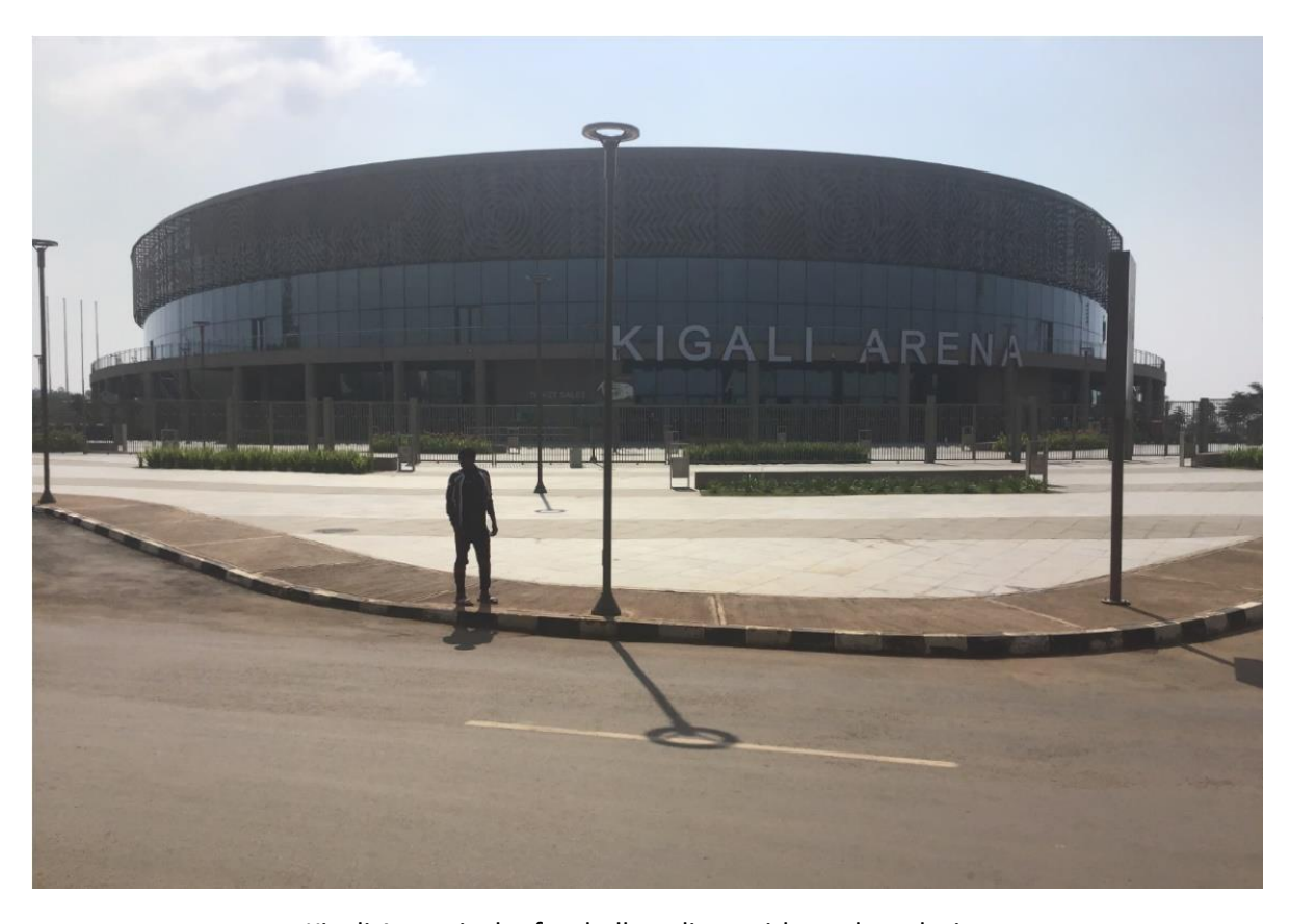
Kigali Arena is the football stadium with modern design