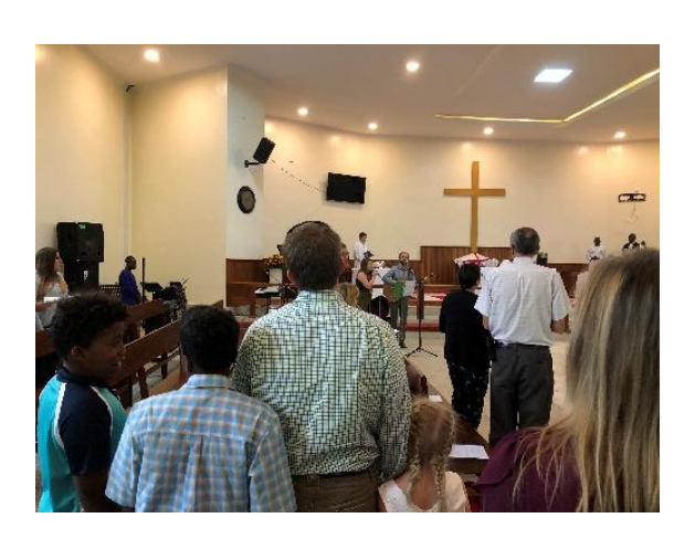
Congregation lining up for the holy communion