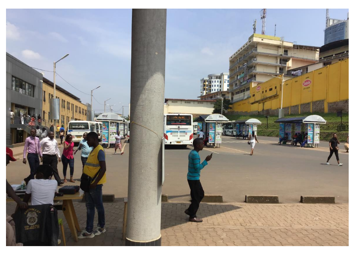
Bus station at the market area