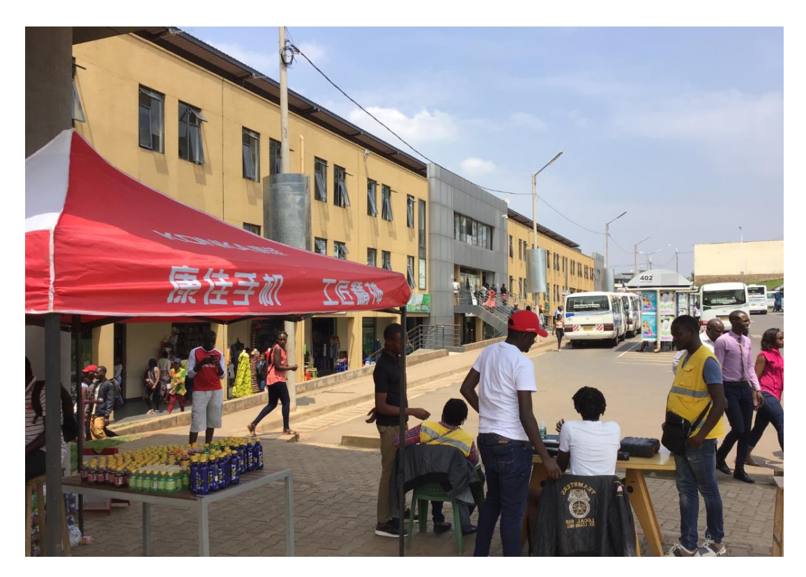
Kigali bus station and market area