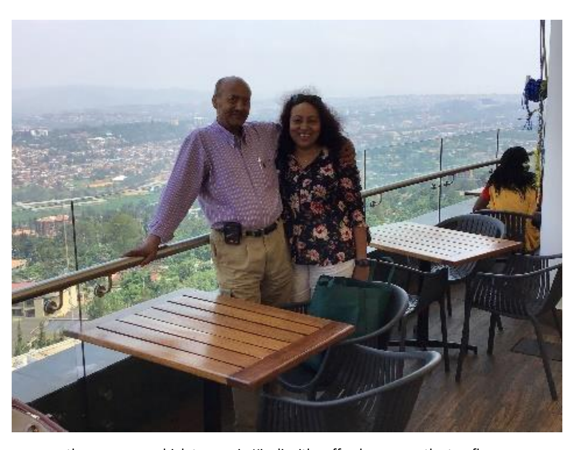
there are many high towers in Kigali with coffee houses on the top floor