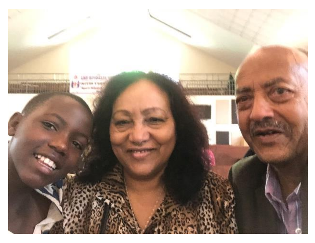
We befriended a young Rwandan at the church