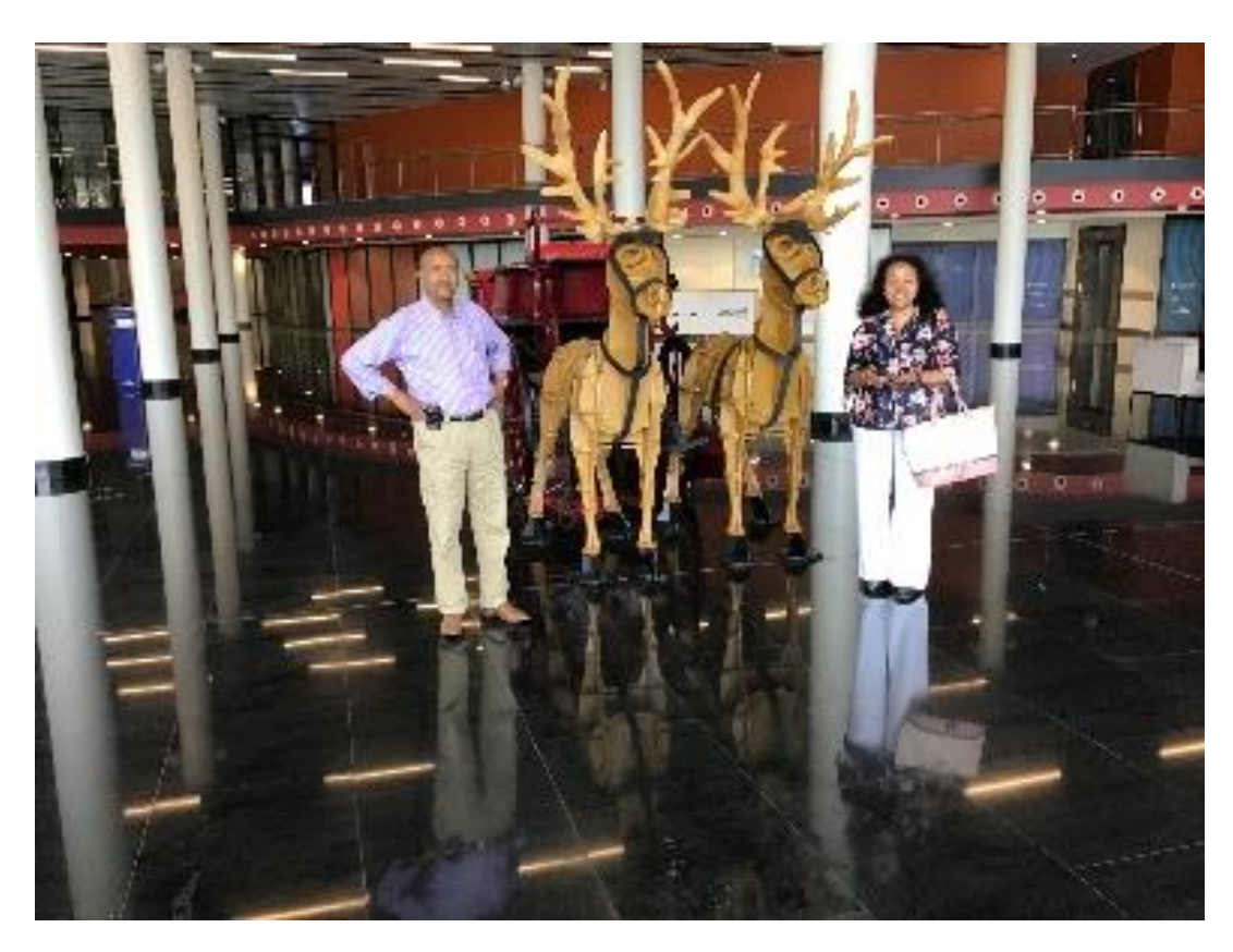
Ground floor of the convention hall